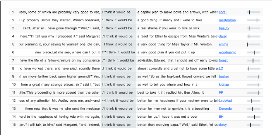
Figure 3. Fifteen of the 39 concordance lines of I think it would be in quotes in DNov, I9C and ChiLit, sorted on the right (one additional concordance line occurs in non-quotes in the first-person narration of Bleak House ), retrieved with CLiC 1.7. Note: In the current version of CLiC 2.0.2, two instances are found in non-quotes (and only 38 in quotes), because one instance is mistagged in ChiLit due to a different tagging algorithm.