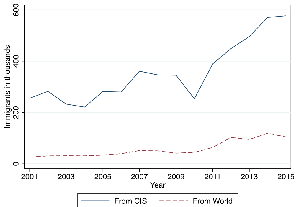
Figure 1. Immigration in the CIS.