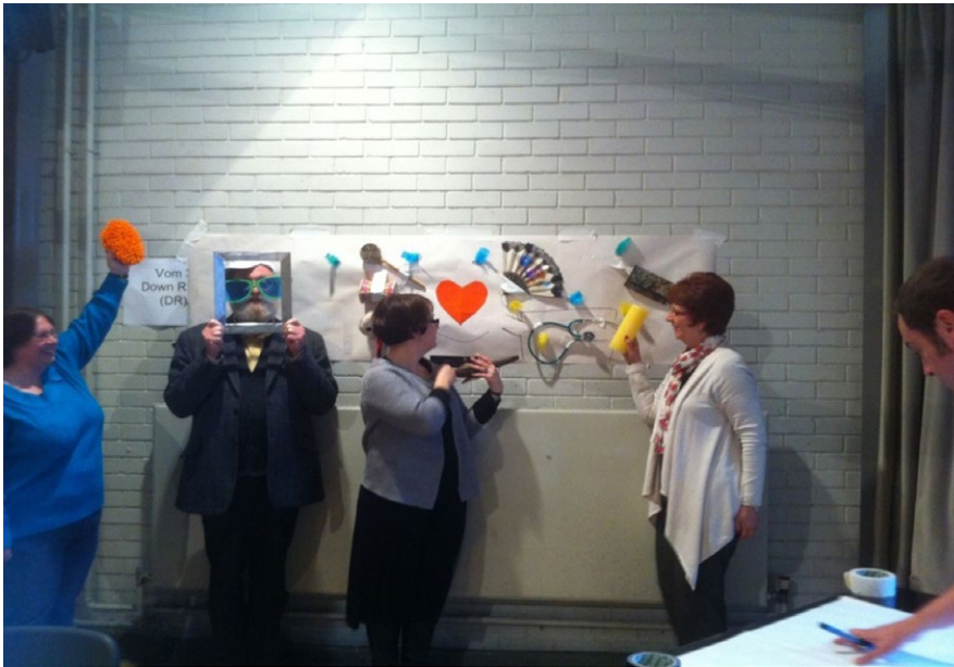
FIGURE 4 Facebook page art installation

The second part of the exercise involved the groups composing a Tweet about good health. This was done in the form of a cinquain (poems comprising 5 lines): the first verse has one word (the title), the second verse has 2 words describing the title, the third verse has 3 actions that make the title happen, the fourth verse has 4 words describing feelings associated with the title, and the final verse has one word which is an alternative word for the title. One group composed this poem about community creativity: