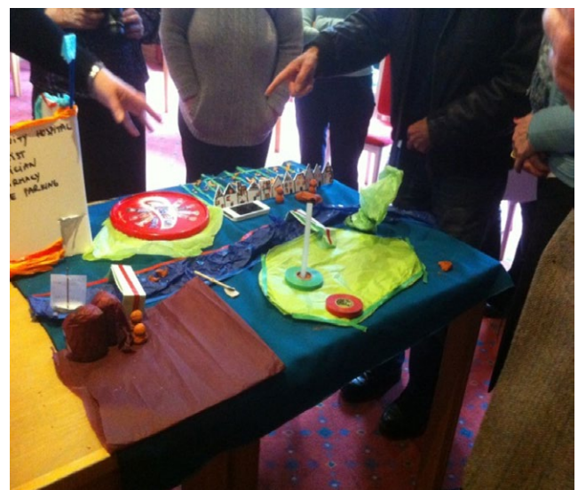
FIGURE 2 Art Installation of a community which has great health

The objects used to create the art installations acted as boundary objects which helped participants make sense of what counted as health to them and share these ideas with other group members. By working together in this embodied and creative way, it was possible for individuals from different backgrounds to connect, communicate and achieve some consensus around a topic that generated strong feelings and emotions. In subsequent interviews, participants reflected on their collective work, commenting that these "healthy communities" were not fantasies in that aspects of such communities already existed or could easily exist if people simply changed their perception and understanding of health. In contrast to the perception of Stoke-on-Trent as deeply unhealthy that was given via the official statistics, the CA activities identified and highlighted positive aspects of the local communities represented in the workshop. One community member said in the follow-up interview: "We don't need to associate the GP [General Practitioner] with health. The GP wants to deal with ill health issues that can be cured through medication and operations." This was reiterated by another member of the public: "Communities should come up with their own measures of health. What is measured in health is far from day to day life and the solutions are so huge that communities do not think they could have an influence"