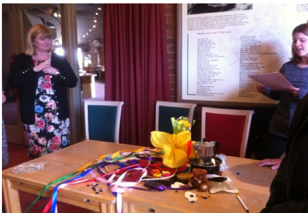
FIGURE 1 Art installation representing a community that has great health

You see here the river, the open green spaces, other people who speak to you