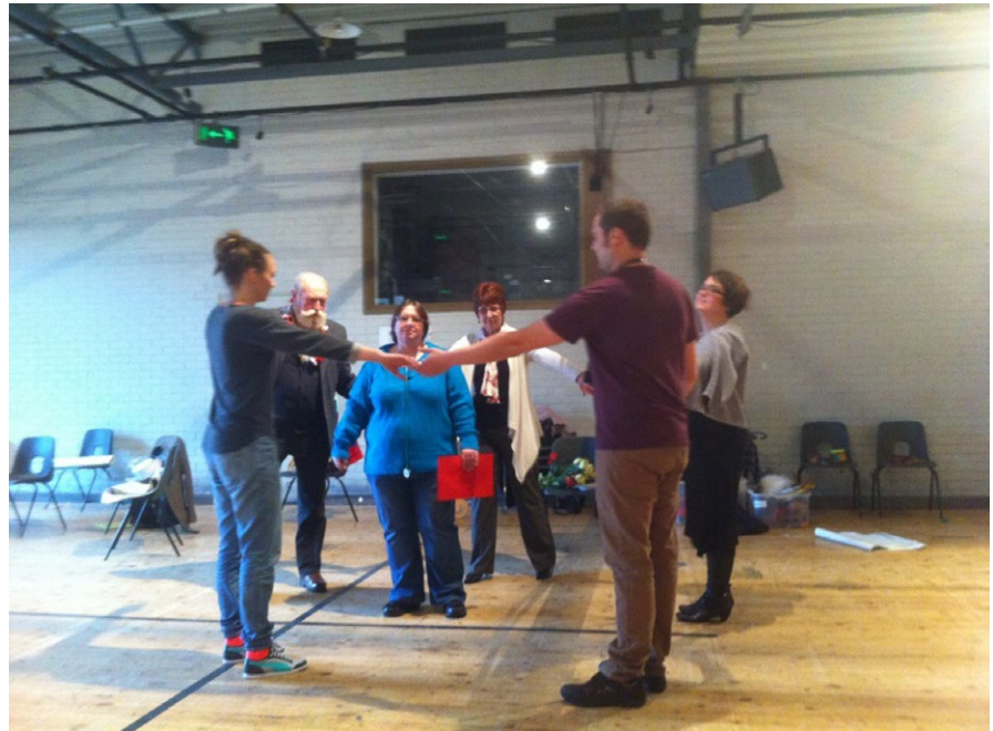
FIGURE 5 Presentation to the government

inclusivity and acceptance of difference. Participants felt that such indicators are more relevant than currently used indicators which actually measure ill health according to parameters such as teenage pregnancy, obesity levels and alcoholism.