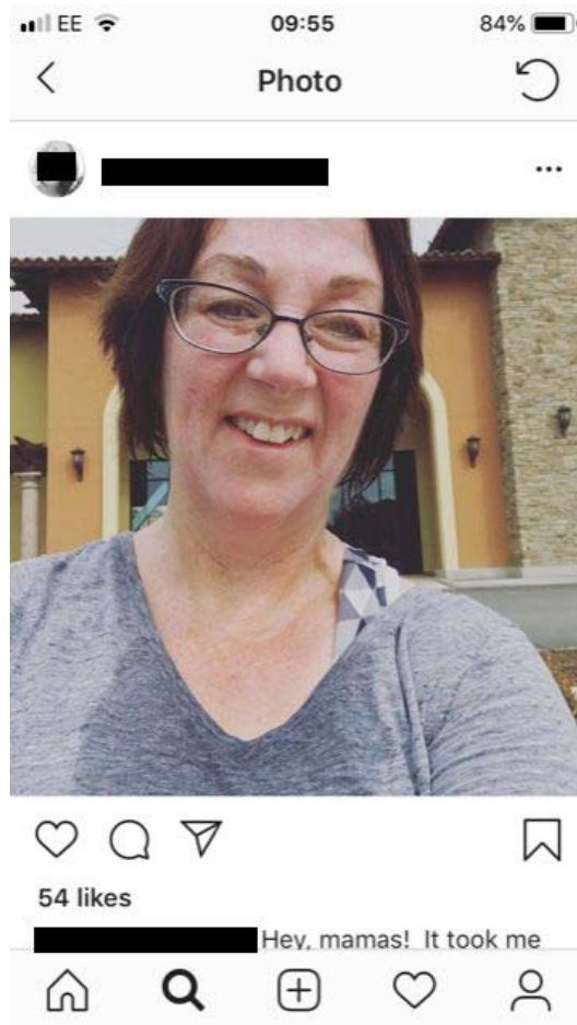
Figure 6. Fitness selfie tagged with #uglyselfie

The positive evaluation of the image is seen in the specific types of compliment that are found as preferred responses in the comments within this type of post event, namely compliments which praise the selfie-taker's achievements and which offer specific advice to keep training. For example, in the responses to the image shown here, the comments included praise and encouragement, such as, 'You inspire me! Go girl!' 'Way to go! Good for the heart, mind and soul'. This was typical of the comments found in other similar posts, such as 'Good for you! Sweating on a Saturday' and 'Keep it up!'