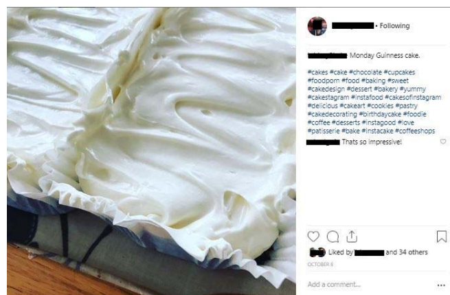
Figure 2. Instagram post event showing an image, caption, comments and likes.

#cakes #cake #chocolate #cupcakes #foodporn #food #baking #sweet #cakedesign #dessert #bakery #yummy #cakestagram #instafood #cakesofinstagram #delicious #cakeart #cookies #pastry #birthdaycake #foodie #coffee #desserts #instagood #love #patisserie #bake #instacake #coffeeshops .