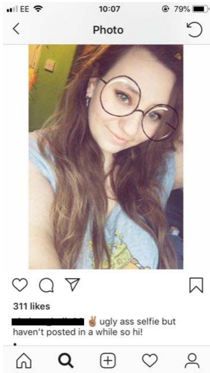
Figure 4. Selfie showing image-text incongruence

There is evidence in the comments within the post events that the recipients interpreted the image as incongruent with the selfie-taker's verbal evaluation of the image as 'ugly'. The comments include denials of the self-deprecation and compliments which boosted the quality face of the selfie-taker by praising her appearance. In the case of the image shown in Figure 4, the comments begin with the denial combined with a compliment 'Not ugly at all, beautiful [flames emoji]'. This pattern is also found in many other examples in the data, which included denials such as 'you're not ugly' and compliments such as 'beautiful', 'gorgeous', 'sexy', 'cool gallery!!!', 'Stunning'.