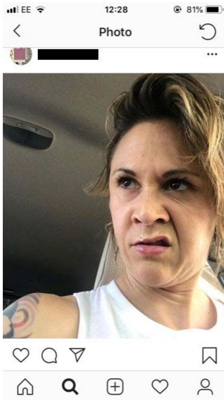
Figure 7. Example of jocular self-mockery in an ugly selfie.

The mixed messages that arise from these types of images are similar to the jocular mockery described by Haugh (2010), but rather than using lexical exaggeration and incongruous imagery the selfie employs visual exaggeration and incongruity. Like the lexical overstatement and incongruity that signals jocularity documented in studies of conversational self-mockery, this visual over-exaggeration expresses ‘too much ugliness’ to be taken seriously and in this case, subverts the idealised norms of selfie taking. As the laughter in the comments posted in response to these images show, for at least some people, the ‘ugly selfie’