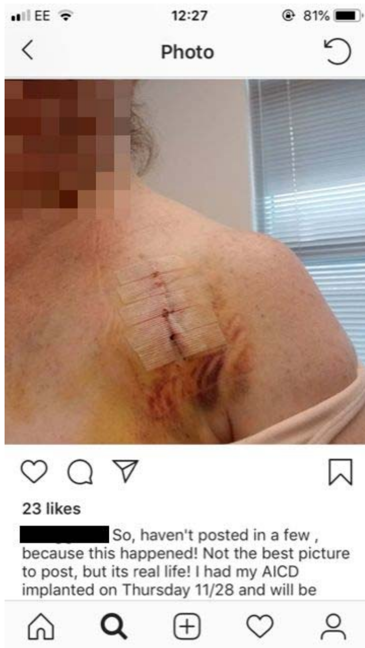
Figure 5. Example of 'trouble' shown in an ugly selfie.

Other examples of 'trouble' that were depicted in the Instagram posts within this study related to external problems, such as more minor physical injury, mundane issues such as tiredness, travel disruption and technical errors relating to selfie-taking, such as too much light exposure within an image or mis-timing of a selfie-timer. In these cases, the images serve to contextualise the 'ugliness' in a way that is similar to the 'trouble-talk' described in conversational studies. The kinds of responses that are included within these types of self-deprecation in Instagram are also similar to those found in earlier studies of conversational data. There were no examples in this data where the self-deprecation was denied, but rather