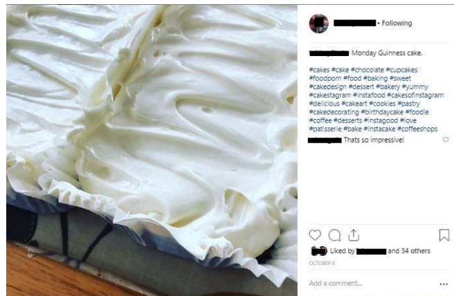
Figure 2. Instagram post event showing an image, caption, comments and likes.

#cakes #cake #chocolate #cupcakes#foodporn #food #baking #sweet#cakedesign #dessert #bakery #yummy#cakestagram #instafood #cakesofinstagram#delicious #cakeart #cookies #pastry #birthdaycake #foodie#coffee #desserts #instagood #love #patisserie #bake #instacake #coffeeshops .