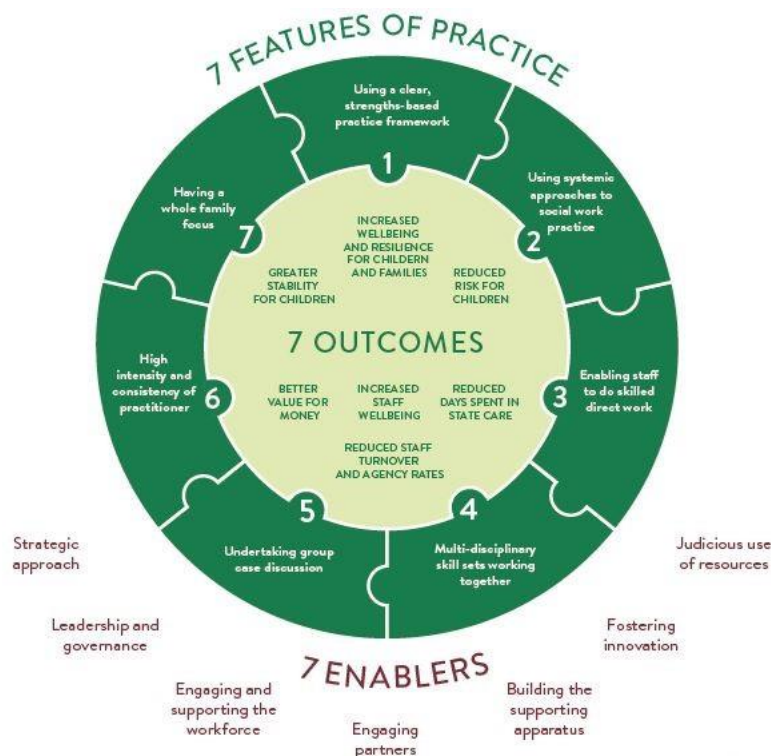
Diagram 1: Seven Features of Practice and Seven Outcomes (DfE, 2018)