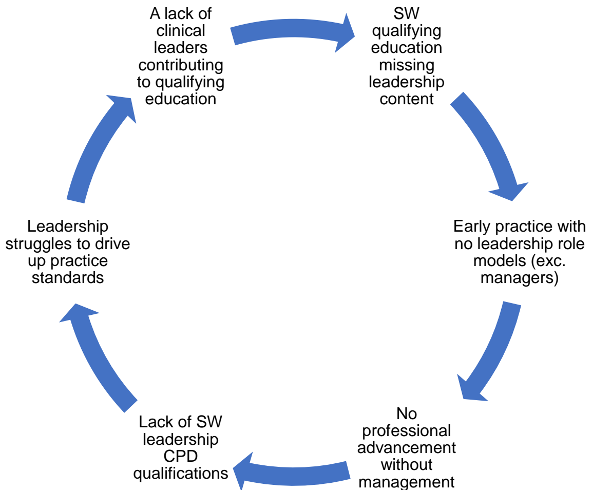
Diagram 4: A cycle of 'missing' leadership

Social work leadership needs a clear definition and relevant models of practice. Distributed, adaptive and collaborative leadership models would all seem to have some accord with underpinning social work values. These could potentially be combined with learning from clinical leadership models in healthcare to develop bespoke social work frameworks and approaches. In relation to a definition, this again needs to build on the distinct principles and purpose of social work, and to be relevant to social work in all the fields in which it is practiced: