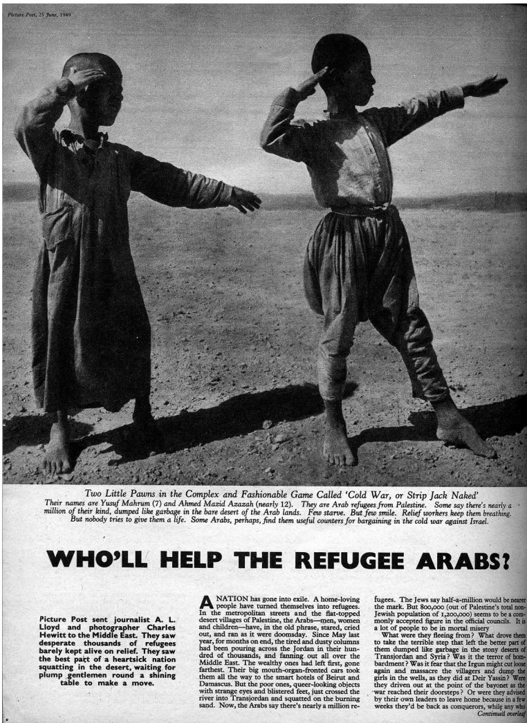
Figure 3. "The best part of a heartsick nation squatting in the desert, waiting for plump gentlemen round a shining table to make a move." Picture post photo essay from June 25, 1949, courtesy of Getty Images.

Azoulay's terms), its humanitarian aesthetic also helped normalize Palestinian suffering. 43