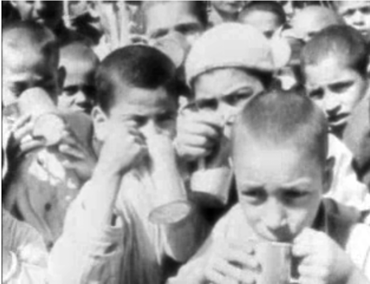
Figure 1. Children “old beyond their years” drinking milk in Gaza. Still from American Council for the Relief of Palestinians, Sands of Sorrow (1950).

the distribution of relief in a refugee camp and ends with a shot of two sickly children who, we are told, were “dead a week later” (fig. 1). The deadly consequences of mass displacement could not be clearer. The semblances with recent atrocities, and their moral and political lessons are all present, but with the new quietly stated implication that the plight of the Palestinians throws doubt on the moral claims of the postwar new dawn for human rights. The narrator, John Martin, closes the film with these lines: “One hears a great deal about the highest principles expounded in the Four Freedoms. Let it not be said that civilization will long permit the kind of freedoms enjoyed by the Palestinian Arab refugees today.”