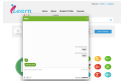
Figure 1: A Screenshot of the Website Showing the Chat.

At the start, learners were required to set up a username and a password. Subsequently, learners were asked to supply demographic information, including their age and gender. Learners were then asked to fill in a BFI personality test. Finally, learners were asked to fill in a pre-test related to the course itself.