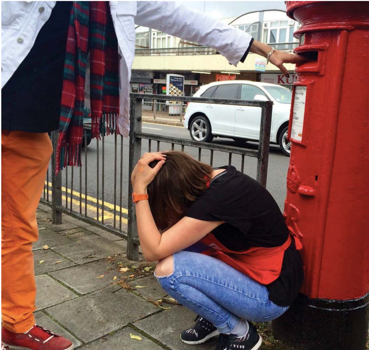
Figure 5: 'Crouch/Touch/Engage' presented on Twitter.