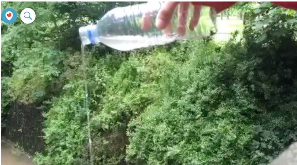
Figure 3: A video still of the Periscope recording from the ‘Dead Homies Bridge’ performance.

The use of Periscope, a live streaming film service, allowed the piece to be shared beyond the physical location (Figure 3). This input from the virtual observer inspired the naming of the piece: “ Dead Homies Bridge / red silhouettes taking water to source / associations with poison, passion and seduction ”. Not only does this demonstrate the production of art through social media, but also a way of receiving feedback from, and engagement with, a wider audience. This virtual participatory approach can be used within both art and geography (e.g. #24Echo and Participatory Geographies) and demonstrates that physical presence is not always essential for participation.