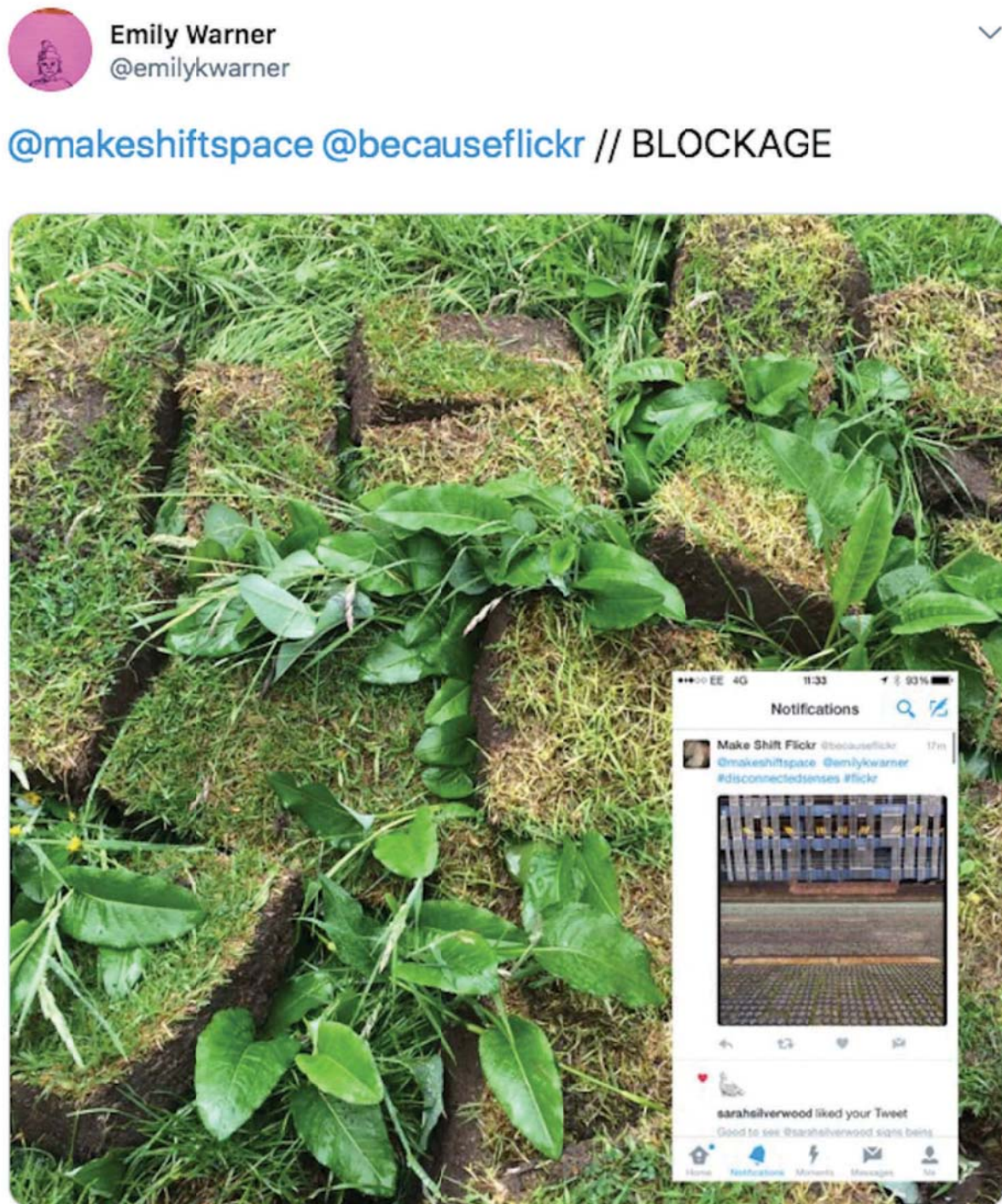
Figure 4: 'BLOCKAGE' - Representing a Flickr image in the surroundings.