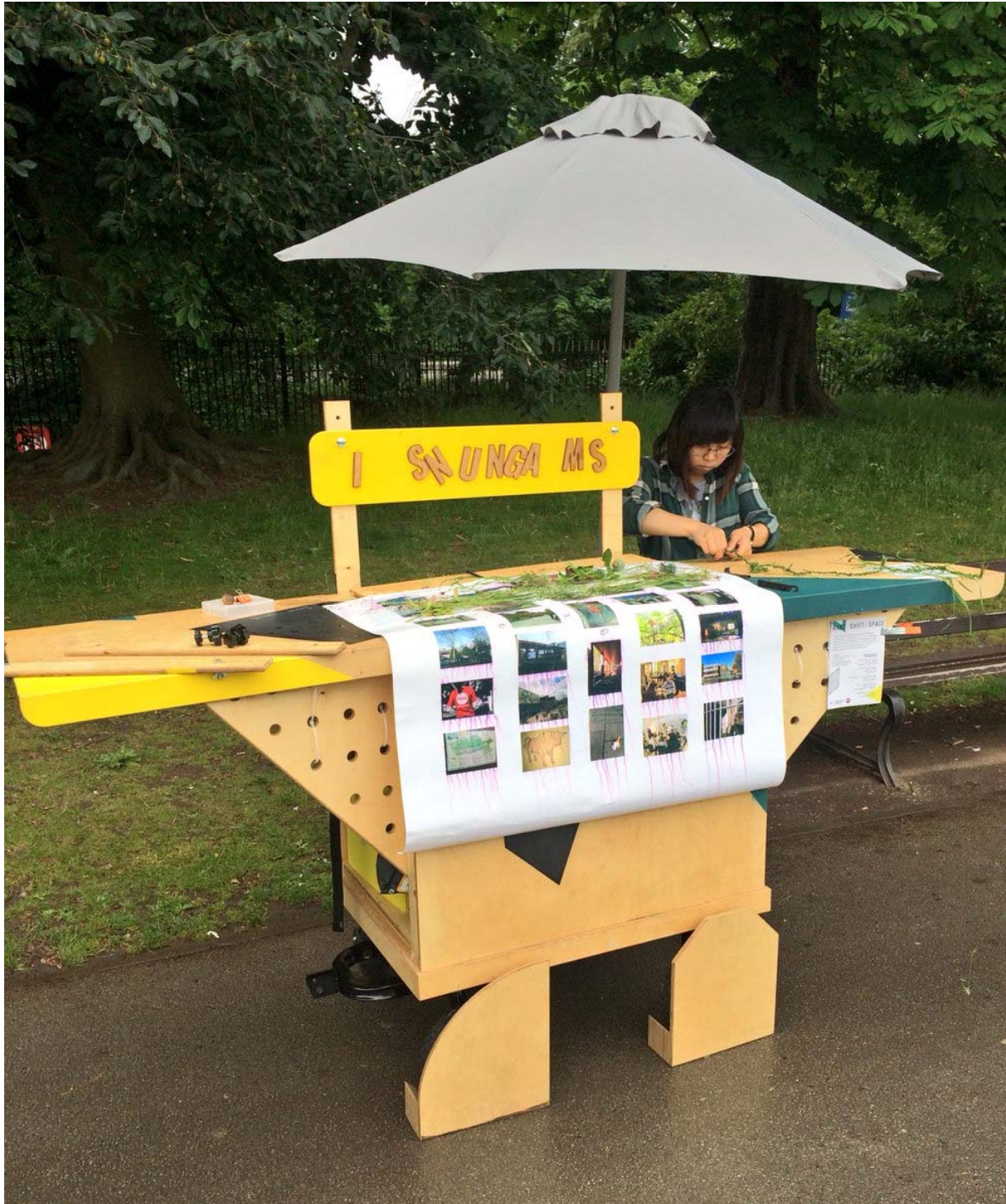
Figure 2: Make/Shift/Space structure with printed Flickr images displayed

Crouch/Touch/Engage ) demonstrate the ways in which social media data can be re-appropriated in creation of art and, crucially, produce alternative narratives that consider both virtual and physical prompts of each space.