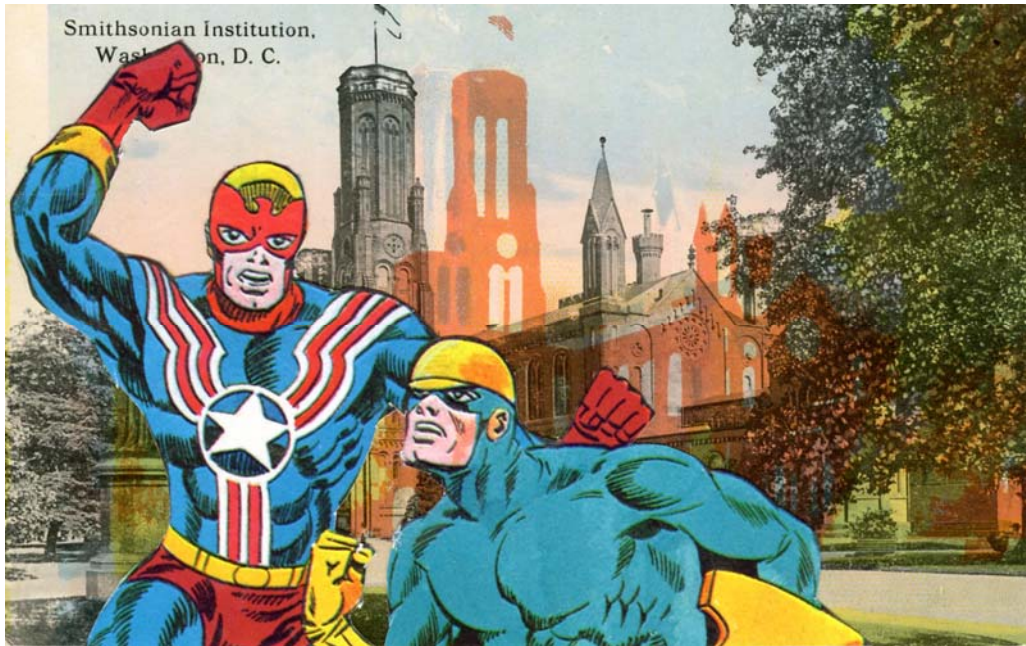
Figure 9. John Ashbery. Diffusion of Knowledge . 1972. Collage. Courtesy Estate of the Artist and Tibor de Nagy Gallery, New York.