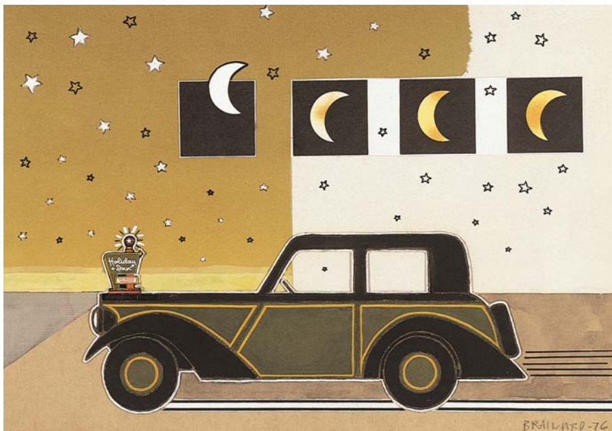
Figure 6. Joe Brainard. Untitled . 1975. Collage. Reprinted by permission of the Estate of Joe Brainard and courtesy of Tibor de Nagy Gallery, New York.