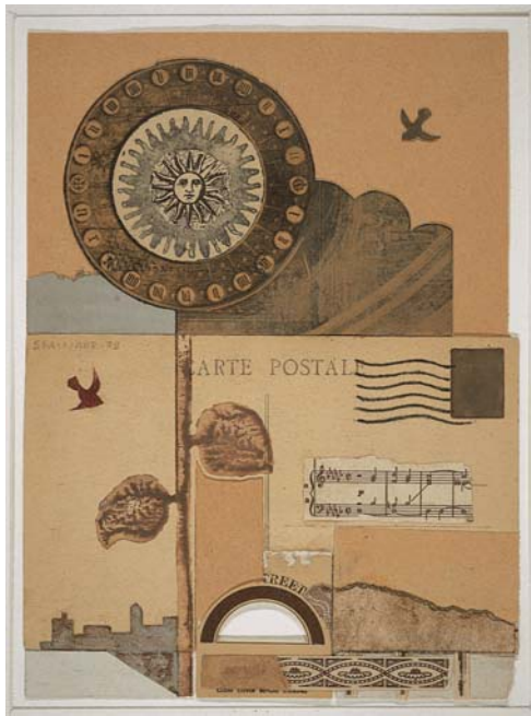
Figure 5. Joe Brainard. Carte Postale . 1978. Collage.