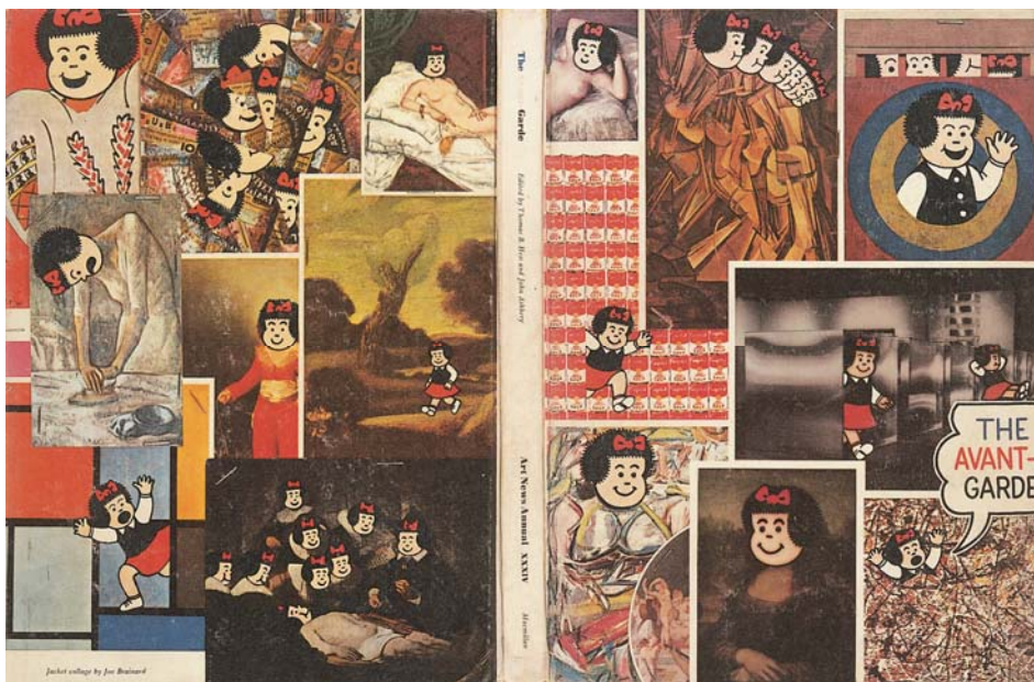
Figure 1. Joe Brainard, cover for ARTnews Annual 34, 1968. Reprinted by permission of the Estate of Joe Brainard and courtesy of Tibor de Nagy Gallery, New York.

the feeling of time passing, of things happening, of a 'plot', though it would be difficult to say precisely what is going on. Sometimes the story has the logic of a dream [...] while at other times it becomes startlingly clear for a moment, as though a change in the wind had suddenly enabled us to hear a conversation that was taking place some distance away. 64