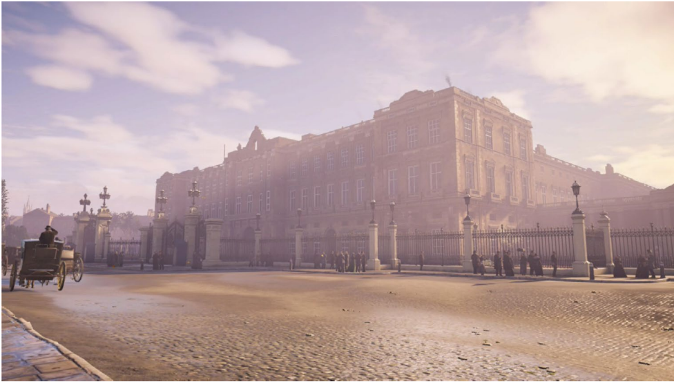
Figure 1. Some games designers expend considerable effort in recreating historic landscapes, as here with Edward Blore's original design for the east frontage of Buckingham Palace as it appeared in the 1860s.

landscapes are built on the requirements of story and play. Flynn (2003) highlights the importance of spatial design to the aesthetics and immersive qualities of games. As Shaw and Sharp (2013, 344) note: