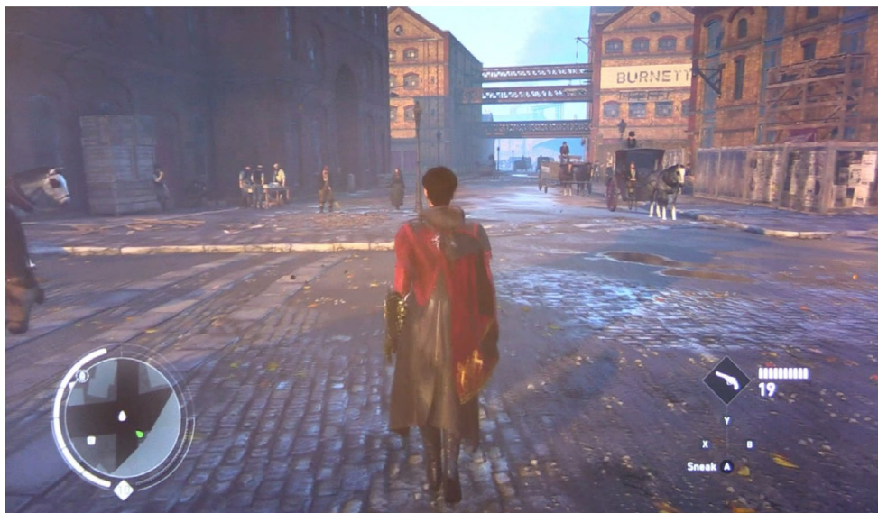
Figure 2. Although the everyday spaces of the warehouse district have an air of gritty realism, they are more the product of the game designers' imagination than the meticulous reconstruction of more famous sites.