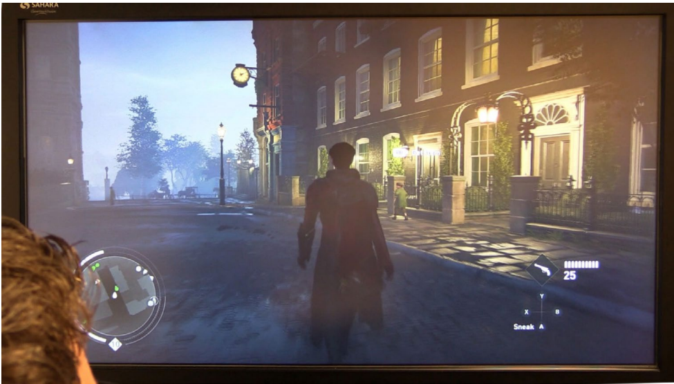
Figure 3. Participant 21 exploring the personally familiar landscape of the government district around Downing Street.

Source: Assassin's Creed: Syndicate , Ubisoft 2015. Gameplay footage from Participant 21.