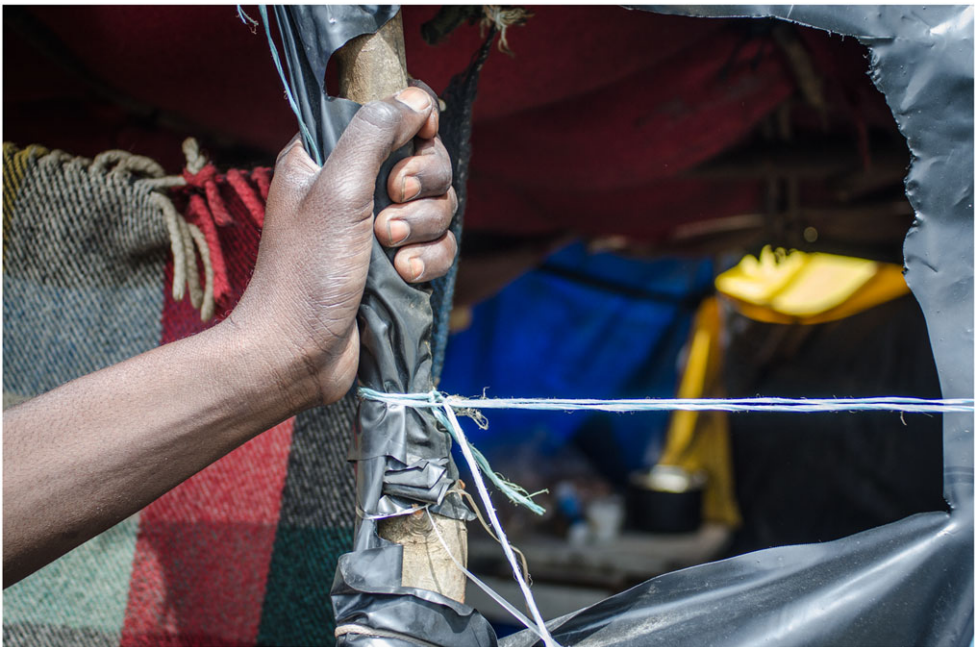
Figure 5: A Sudanese refugee in the Calais camp holds onto his ramshackle shelter, made from branches, string, and plastic bags [Colour figure can be viewed at wileyonlinelibrary.com ]

The architectural morphology of the camp was in a constant state of flux, with new refugees arriving daily and the regular construction of improvised shelters to escape the elements. Accommodation for the thousands of destitute residents consisted largely of ramshackle shelters made from scrap wood, branches and plastic sheeting as well as donated tents (see Figures 5 and 6). This too resulted in a slow violence on the refugee body: interviewees with breathing difficulties