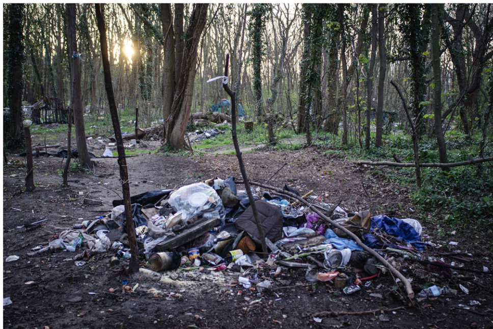
Figure 3: A former squatter camp near Calais, forcibly cleared by police in April 2015 [Colour figure can be viewed at wileyonlinelibrary.com ]