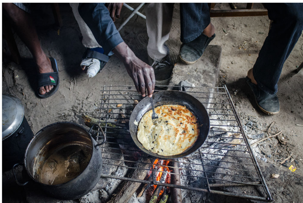
Figure 4: A refugee with an injured foot cooking in a makeshift kitchen inside the “new Jungle”; due to a lack of facilities for clean water and washing facilities, pathogenic bacteria was found in this and other makeshift spaces (see Dhési et al. 2015) [Colour figure can be viewed at wileyonlinelibrary.com ]

The violence that refugees are exposed to in the camp has impacts across different scales, including at the microbiological level, thus highlighting what Farmer (1996:5) calls the “pathogenic roles of social inequalities”. Interviews with residents