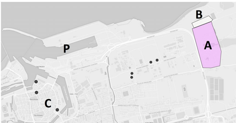
Figure 2: Map of the Calais Camp as it stood during the research period A = Informal New Calais camp or “new jungle”; B = Formal accommodation for 200 women and children; C = Centre of Calais; P = Port area for ferries to the UK; ● = Sites of forcibly cleared encampments [Colour figure can be viewed at wileyonlinelibrary.com ]

In recent years camps have been the landscapes of significant political change and revolution. The barricaded battleground of the Maidan in Ukraine, for example, which helped overthrow President Yanukovich (Phillips 2014), or the events in Egypt’s Tahrir Square where the “camp defeated the dictator” (Ramadan 2013b). While the geopolitical importance of these spaces has been made clear (Minca 2005), as well as their potential to be everyday sites of political resistance and urban experimentation (Katz 2016; Sigona 2015), the informal refugee camp within the EU has increasingly become a space of stagnation and a symptom of political failure.