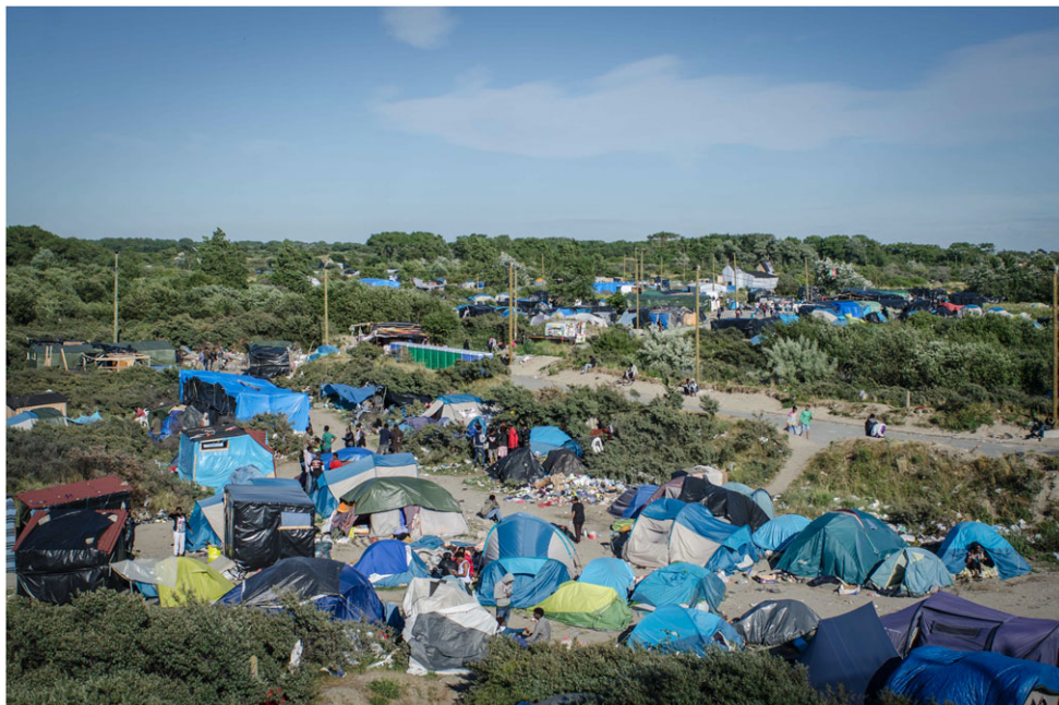
Figure 6: A view of the tents and makeshift structures in the western part of the Calais camp [Colour figure can be viewed at wileyonlinelibrary.com ]

reported their conditions worsening over time by damp and cold conditions, whilst all residents interviewed reported being extremely cold, especially during the night. This permanent wounding of refugees would not be as grievous if it was for a short period, but some residents had been exposed to such conditions for up to a year, articulating how they felt “trapped”. As security around the port town increased in the summer of 2015, the possibility of reaching the UK was reduced and the camp was increasingly seen as a temporary home, with refugees having built makeshift educational, community and religious spaces.