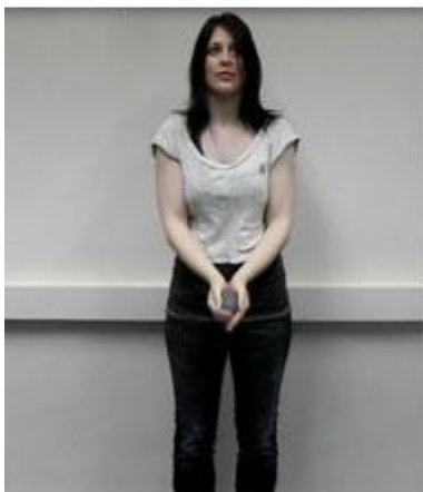
C: Test video 1