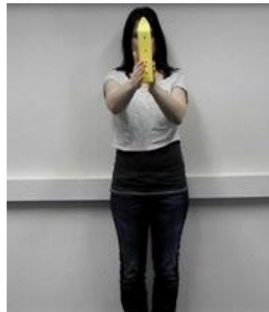
D: Test video 2