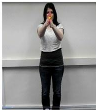
B: Exemplar video 2