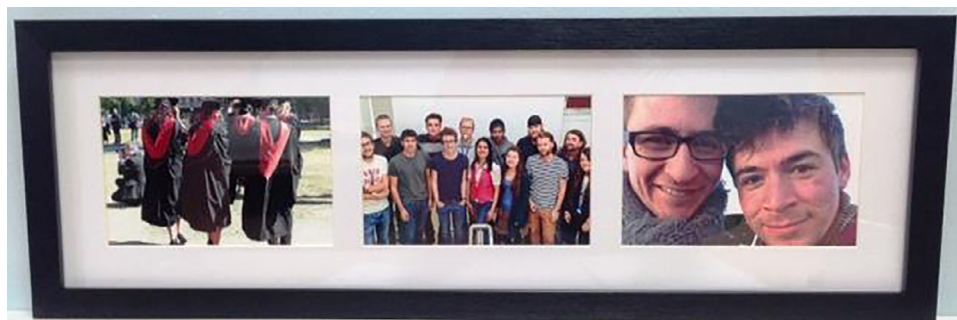
Fig. 3. Triptych photo frame example.

responded to their digital selves as presented in the different formats and what they learned from this process regarding the nature of their SM usage and performance of self. This was the analytical approach from the outset, and our findings represent the analysis of our complete data set. This led to the development of our key findings in establishing a dynamic curation framework, which represented the nature of our participants' response to their digital selves and is outlined below.