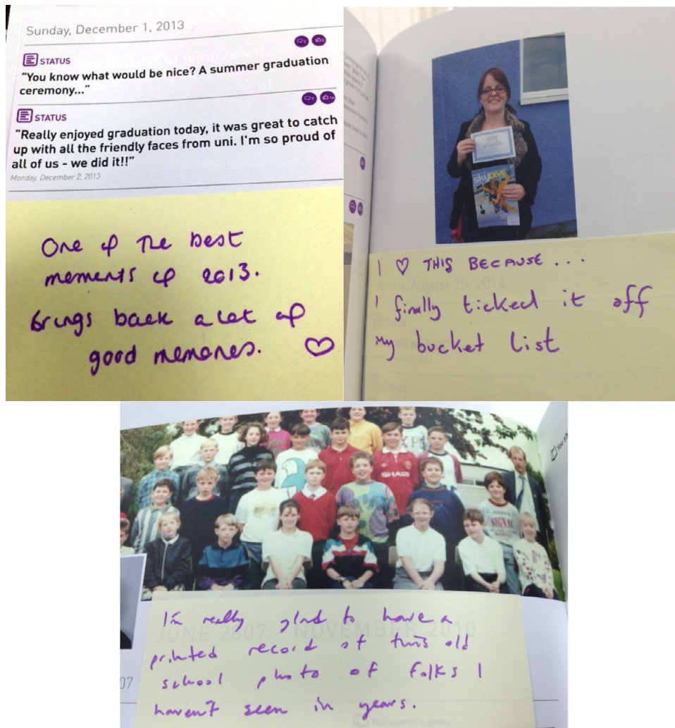
Fig. 2. MySocialBook participant annotations.