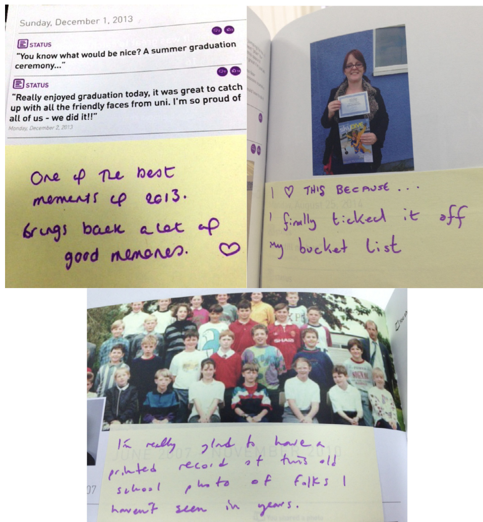
Fig. 2. MySocialBook participant annotations.