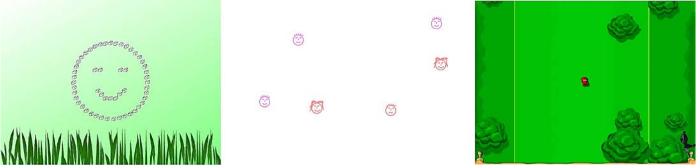
Figure 2 top