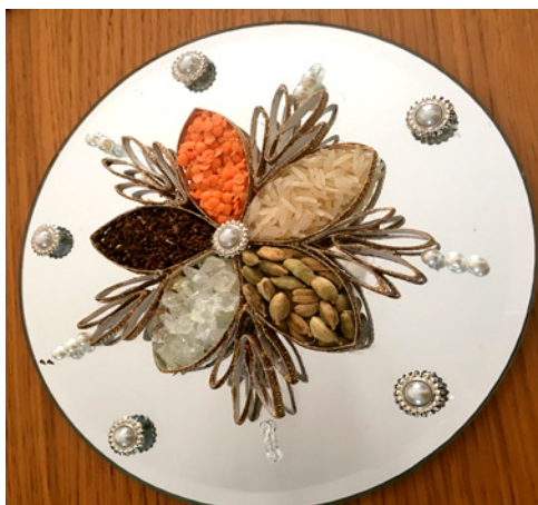
Figure 2. Also referred to as seniyyet bakht (tray of luck) taken by Shanneik 2017 in London.

senses '[b]ut it is only when some substance is ingested that all of the senses can operate together' (Soileau 2012). Rosewater and saffron, which are key ingredients of sweet votive dishes, are sometimes used to wash the bride's feet on the day of the 'aqd . Some add to the sofra the old tradition of what is called the 'tray of luck; ( seniyyet bakht ), which contains various herbs and incense 7 displayed decoratively on a tray (see Figure 2) and is sometimes burned in a censer over charcoal, causing an intensive and pleasant smell in the room.