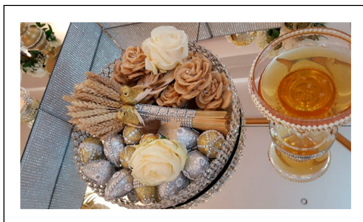
Figure 3. Bread in the shape of flowers, corn, and eggs. Picture delivered by Um Zahra in London 2017.