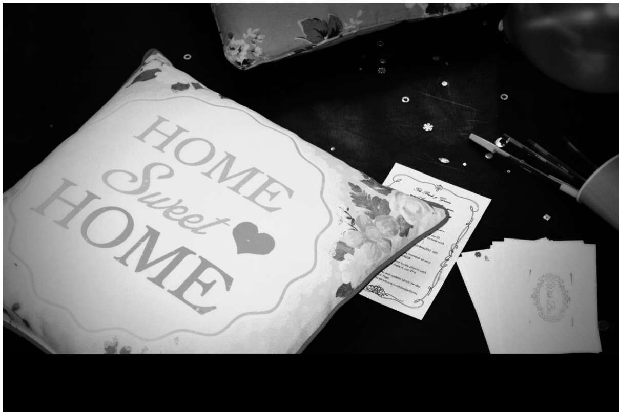
Figure Five: Wish Box cards

Generating wishes, reading and pegging them creates the performer's presence and that of the participants while also performing radicalised possibilities through the actual content of the wishes.