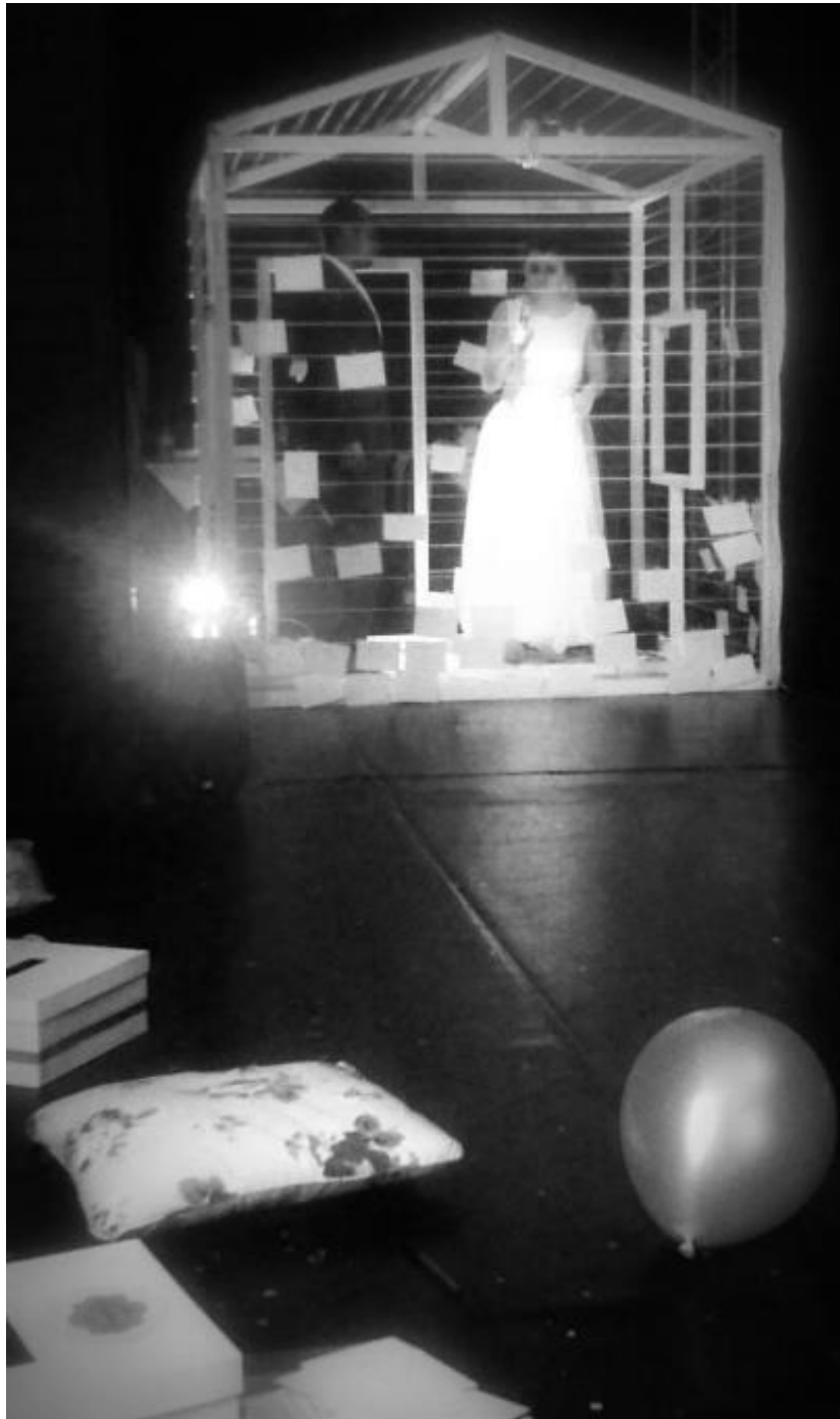
Figure Two: Liminal Performance Space View Two. This image taken during the six hour performance in May 2015.

The wedding reception is subjugated to the critical frame of performance. Each recognisable ritual activity of the social construct of the wedding is exposed as constructed by performance; this offers the participants the possibility to transgress or transcend those