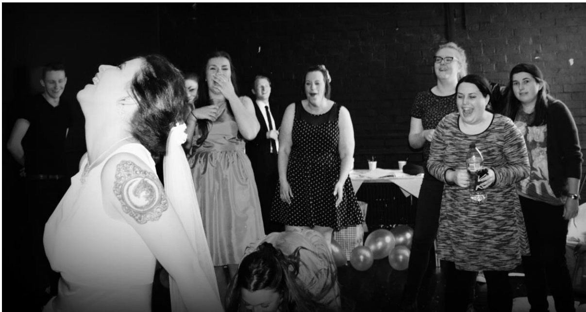
Figure One: Liminal Performance Space View One. This image was taken during the six hour performance in May 2015.

It is the convergence of these two distinctive but recognisable sites of cultural practice that produces the liminality of this particular micro-performance.