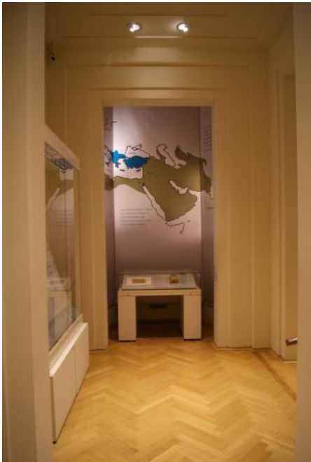
Figure 3 A hanging map of the Umayyad Caliphate (in green) c. 700 was used to help visitors to appreciate the huge change in the geopolitical landscape of the Mediterranean by the rise of Islam.