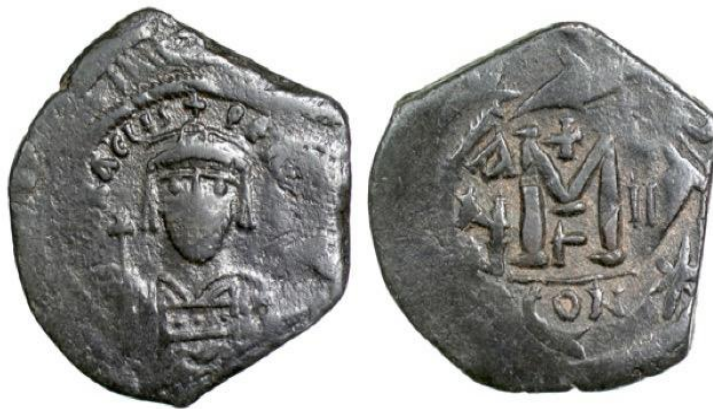
Figure 11 At times of crisis, copper coinage in particular demonstrates few of the qualities associated with fine gold coins, being often illegible, poorly designed and inconsistent in execution.