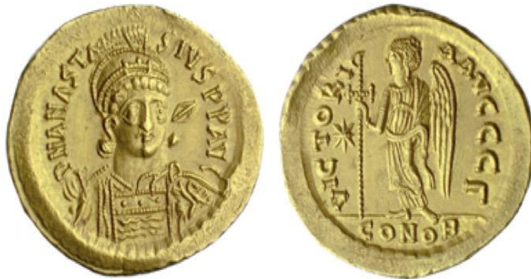
Figure 10 The high-quality gold coinage of the Byzantine Empire was closely associated with imperial glory and reflects tightly-controlled manufacturing processes. (Barber Institute Collection, B0012, used with kind permission of the Barber Institute.)

the metal most people would have encountered. This contrasted with a tendency in museum exhibitions to favour gold and silver coinage because it is seen as being of higher value (which by one measure, of course, it is), because the designs are often clearer and because it is easier to light in often dark museum spaces. This was a compromise which was noticeable at times in Faith and Fortune – some coins were not as clearly lit as might have been ideal. Nevertheless, the emphasis on copper coins in this exhibition at least highlights one disjuncture between the ways in which coins are seen in museums and the ways in which they were seen (or not seen) at their point of use. 44