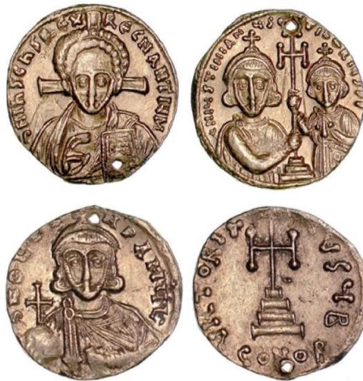
Figure 5 These two solidi of Justinian II (first reign 685-95, second reign 705-11) and Leo III (r. 717-41) demonstrate the different ways in which users might respond to the images on coins, reflected in the position of the piercings in relation to the image of the cross and the portrait. (Barber Institute Collection, B4464 and B4504, used with kind permission of the Barber Institute.)

That Christian imagery on coins did not end up at the centre of written debates (or those that survive), however, does not mean that seventh- and eighth-century coin users were not equally diverse in their responses to it as were the curatorial team or the exhibition's art historical viewer. Though the curators were aware of the visual significance of Christ's portrait on the coinage, and indeed made that the centrepiece of cabinet six, it required the input of a different perspective to observe the inconsistency (from an Orthodox viewpoint) in being aware of this significance and still treating the coin simply as an object to be used as part of a larger design scheme. It is also perhaps significant that in this period Justinian II was the only emperor to display Christ on his coins. Though the image returned in later centuries, his successors immediately discontinued the practice. Use of coins in Late Antiquity, in other words, demonstrates similar inconsistencies and layered considerations to those apparent in the range of modern responses to these coins. These inconsistent responses are, moreover, uncommonly visible on the coinage at a different level to theoretical texts, giving a rare insight into individual behaviour and personal choices beyond the clergy or the literati of the court.