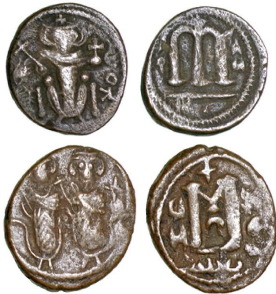
Figure 7 These folles also minted in the mid-seventh century in Damascus and Baalbek likewise represent local uses of widespread imperial prototypes but in these cases and that of the Skythopolis coin previously examined, the choices made are different. (Barber Institute Collection, A-B05 and A-B19, used with kind permission of the Barber Institute.)