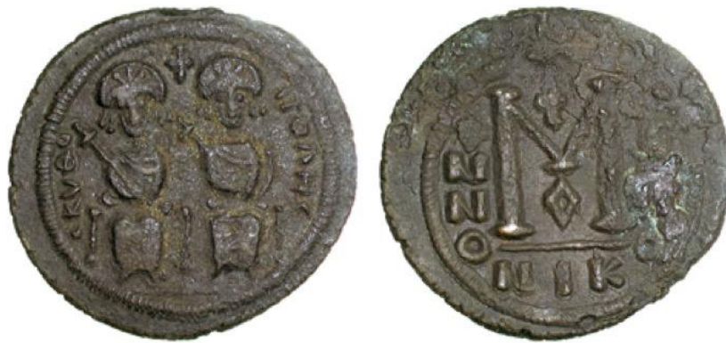
Figure 6 This follis , minted in Skythopolis in the mid-seventh century, displays a range of features imitating Byzantine prototypes, but the die cutter also made distinctive and local choices about the information presented. (Barber Institute Collection, A-B01, used with kind permission of the Barber Institute.)

value of the coin, of 40 nummi though it is impossible to tell what these local issues might have been worth or how this may have been calculated or enforced. NIK was the mint mark of the city of Nikomedeia, which had produced coins of this design in the late sixth century, probably including the prototype for this example. Thus, a range of different texts are displayed on this coin, some with conflicting meanings. Their relevance depends on the register in which they are read: NIK conveyed the familiarity of the type and therefore its reliability and usability, just like the choice of an out-dated but recognisable and traditional type, but it no longer carried any geographical meaning. 'Skythopolis' communicated its local origin and perhaps something about the authority which issued it.