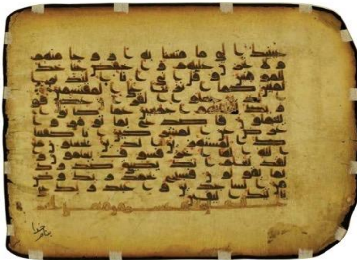
Figure 8 9th-century Qur'an, written in Kufic script on vellum, uses no figural imagery. Its production location is unknown.