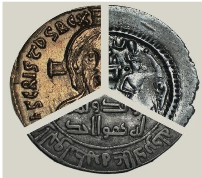
Figure 4 Three coins, used to represent the Byzantine and Sasanian empires and the Umayyad Caliphate, were presented as components of a single composite image at the centre of the display board in cabinet three.

One of the coins chosen (upper left, Fig. 4) was the Byzantine gold solidus of Justinian II, which bears on its obverse, instead of the emperor, the bust of Christ. Upon seeing this for the first time, a colleague with a background in Byzantine art history and theology pointed out that the way in which the coins had been divided entailed cutting the image of Christ, which could be perceived as iconoclastic. Apart from highlighting a possible and overlooked area of offence, which was in no way the aim of the exhibition, in the context of Byzantine coins and the imagery on them, this has particular significance.