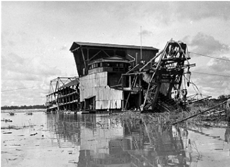
Figure 4: Tin bucket dredge north of Manggar, East Belitung, 1937.

But as is often the case, the solution for one set of problems brought new ones. Although historians have suggested that dredging markedly reduced the ecological costs of mining, it is more accurate to say that it displaced them from the hillsides and rivers to the lowlands and