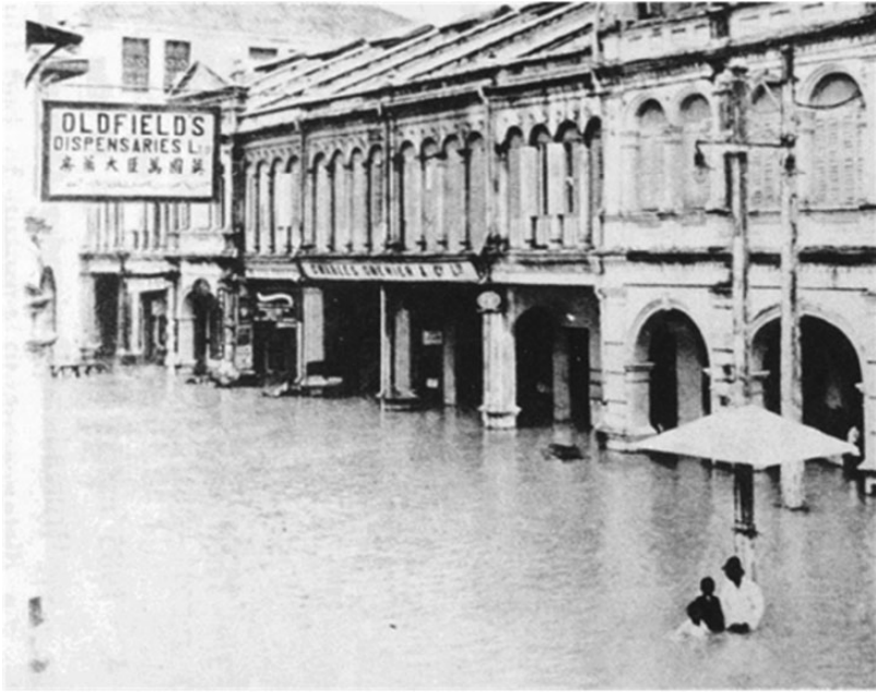
Figure 3: Ipoh during the Great Flood of 1926.