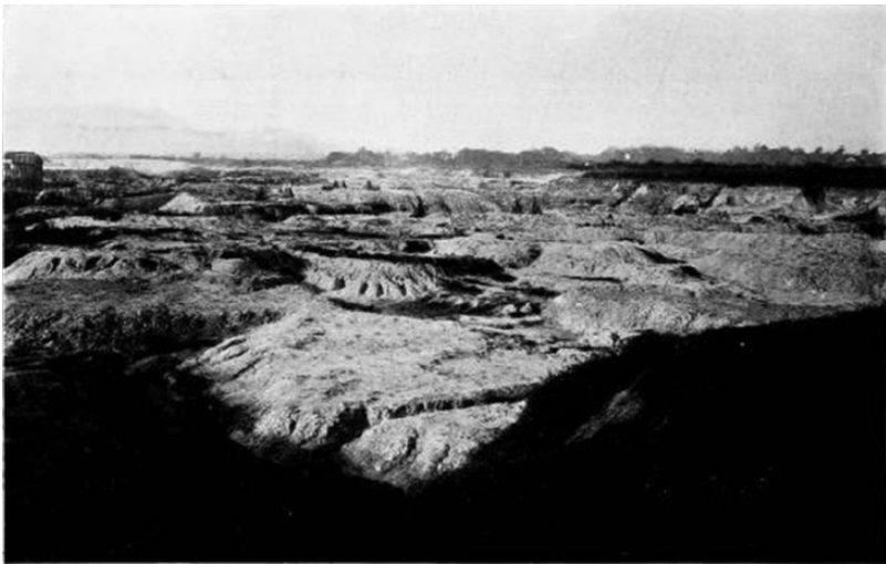
Figure 1: Yong Phin Open-Cast Mine near Taiping, 1908. Credit: Arnold Wright and H. A. Cartwright, eds., Twentieth-Century Impressions of British Malaya: Its History, People, Commerce, Industries, and Resources (London: Lloyds, 1908).

All of these methods were extensive and correspondingly destructive: they worked the shallowest and most accessible deposits and quickly abandoned them, leaving denuded and severely eroded hillsides in their wake. As the industry expanded in the late nineteenth century, both the aesthetic and material costs were increasingly manifested in pockmarked and scarred landscapes, abandoned wastelands, and silt-laden rivers. "Being full of large holes, and covered with an excavated soil of gravel and sand [. . .] such land is a great eyesore, and gives a bad impression of the country to the casual traveler," noted a visitor to Malaysia in 1904. 15 As production rose, the valuable Dipterocarp