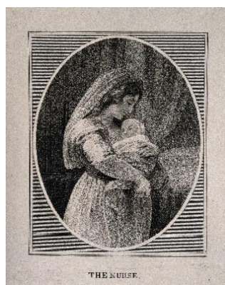
Fig. 1. A nurse holding a baby.

Marryat’s early autobiographical experiences with her own nursemaid reveal the formative influences and imaginative impressions that mothers and mother figures had on her fictional oeuvre. In 1894, Marryat stressed her disdain for inhibiting the morbid musings of children; she recalls her own “ignorant nursemaid”, who took her to watch funerals, and who, if faced with insubordinate behavior, threatened to “tell the dead men to come and carry me away”. Marryat believed her responsible for seeding, during her “tenderest years”, early anti-