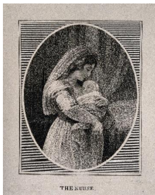
Fig. 1. A nurse holding a baby.

Marryat’s early autobiographical experiences with her own nursemaid reveal the formative influences and imaginative impressions that mothers and mother figures had on her fictional oeuvre. In 1894, Marryat stressed her disdain for inhibiting the morbid musings of children; she recalls her own “ignorant nursemaid”, who took her to watch funerals, and who, if faced with insubordinate behavior, threatened to “tell the dead men to come and carry me away”. Marryat believed her responsible for seeding, during her “tenderest years”, early anti-