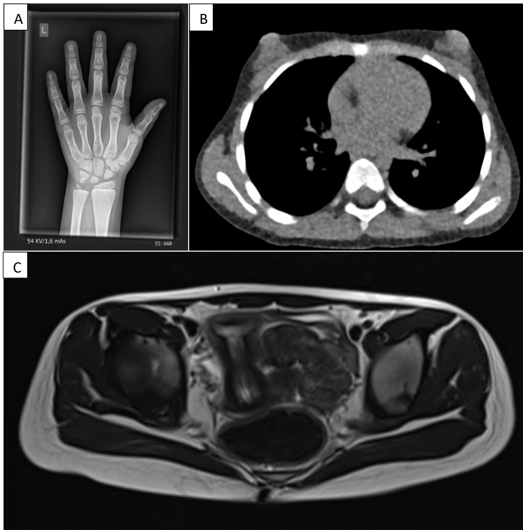
Figure 2 illustrates radiological imaging taken 18 months after the commencement of mitotane therapy

A: Carpogram of the left hand reveals an accelerated bone age equivalent to 6.8 years in a 5.1-year-old girl. B: Low-dose CT thorax exhibits additional breast growth at Tanner stage 2. C: Pelvic MRI indicates uterine enlargement with an uterine volume of 38 ml and an endometrial thickness of 5.8 mm.