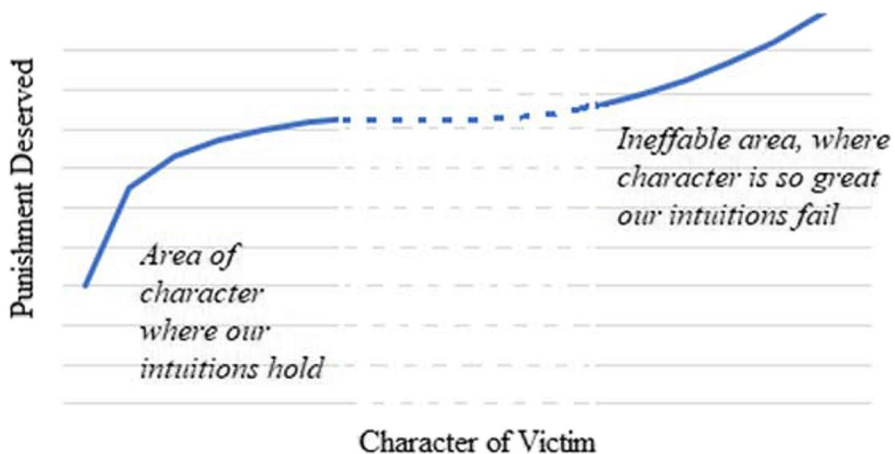
Fig. 3 (Eventually) hyperbolic relationship

The same division can be applied to the problem of Hell. The logical problem of Hell concludes that there is no logically consistent explanation for God eternally punishing people. The evidential problem of Hell concludes instead that, given the evidence that we have to hand, we should not believe that God punishes people for eternity.