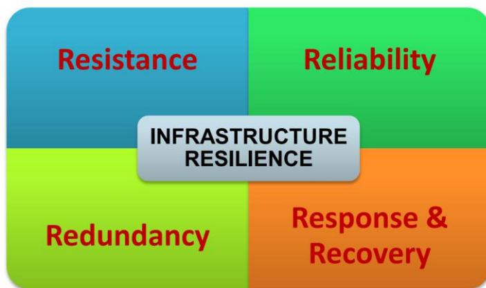
Figure 3: The different components of infrastructure resilience. Image taken from a 2011 Cabinet Office report: Keeping the Country Running (Cabinet Office, 2011).