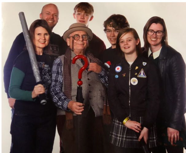
Fig 2 | Lead researcher (top left) and family members with actor Sylvester McCoy (holding umbrella) who played the seventh Doctor in Doctor Who , and actor Sophie Aldred (with baton) who played the Doctor's companion, Ace

To answer the research question, the regression also included a binary covariate for festive broadcast group (was Doctor Who broadcast during the previous festive period? 1 yes, 0 no), to estimate whether Doctor Who festive broadcasts are associated with a change in the subsequent annual mortality rate, after accounting for the general non-linear reduction in rates over time. This was then repeated to examine the binary covariate