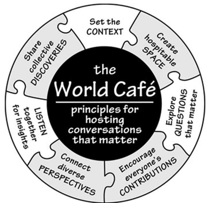
Fig. 1. Principles for hosting World Cafés

Fig. 1, below, outlines the seven principles for hosting World Cafés. All participants are viewed as experts by their own experience. Diverse