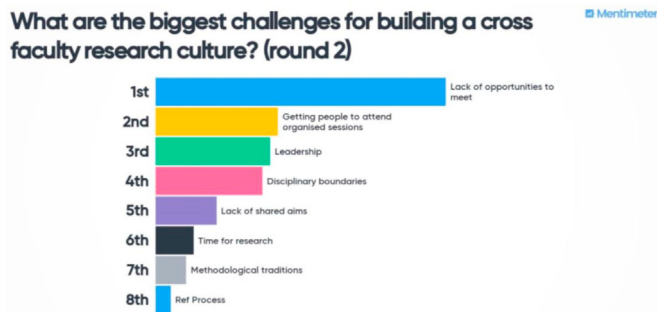
Fig. 3. Ranking of challenges identified.