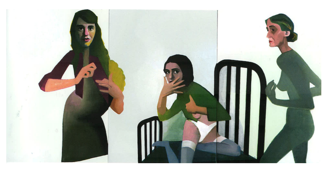
Fig. 2 – Cross Point , Beppe Devalle 2005.