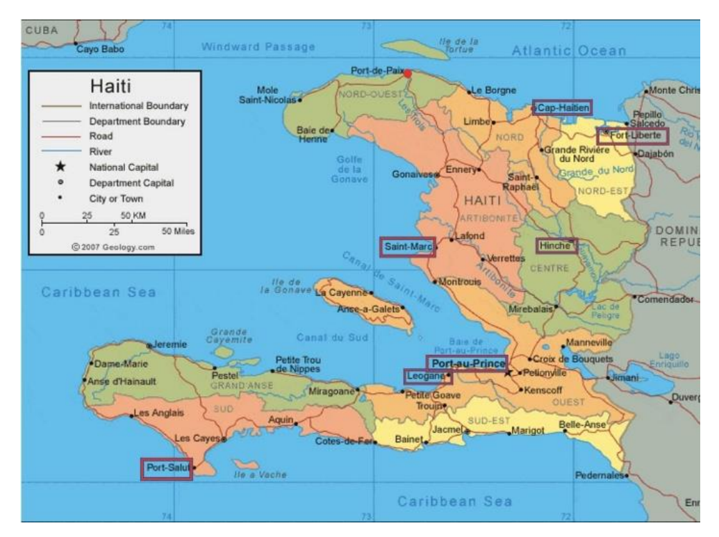
Fig 1A Map of Interview Locations in Haiti

The locations of the SenseMaker interviews conducted in the parent study are shown in the following figure. Port-au-Prince includes UN bases at Cité Soleil, Charlie Log Base, and Tabarre. In this study, data from St. Marc is combined with Gonaïves, and Fort Liberté is combined with Morne Cassé due to their geographic proximities.