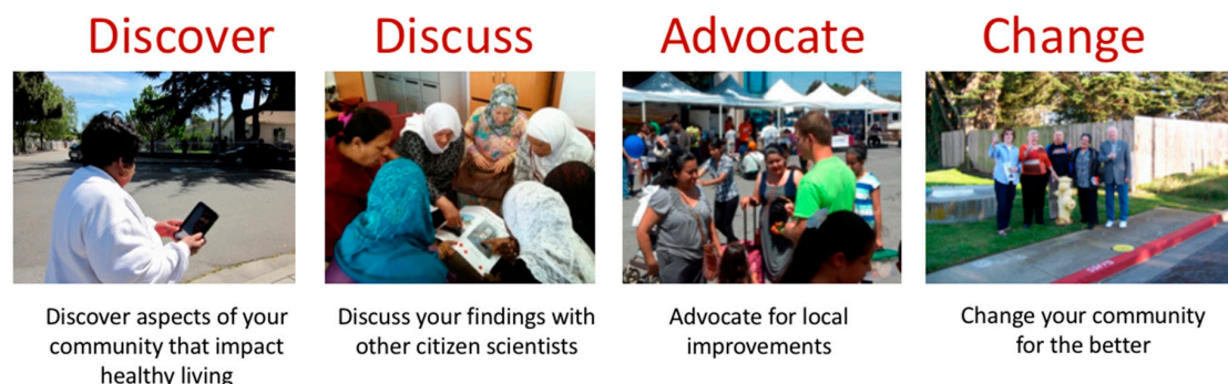
Figure 1. The 4 step Our Voice citizen science model [24].