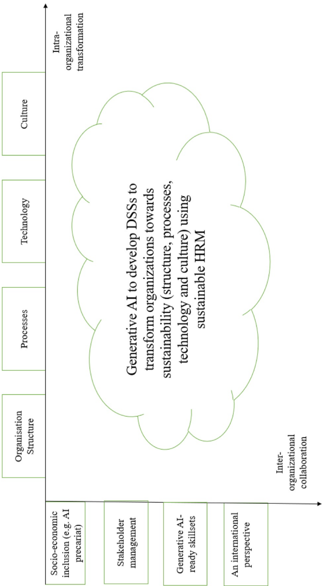
FIGURE 6 Research scope of generative AI to embed sustainability within organizations through sustainable HRM.