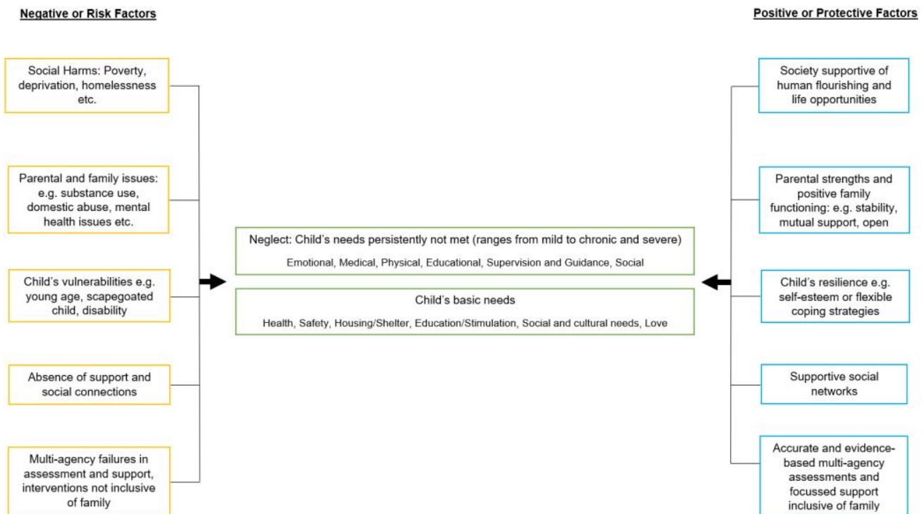
Figure 1. Child neglect theory of change.

Our child neglect theory of change (see Figure 1 below) provides a framework to guide the project. It was developed from a review of the literature on neglect (including its key dimensions and drivers) and the literature on children's needs, alongside consultation with our advisory group. It depicts the neglect typology used here and includes key risk and protective factors at personal, family, professional, community, and societal levels. It aims to simply capture the complex social mechanisms involved in neglect.