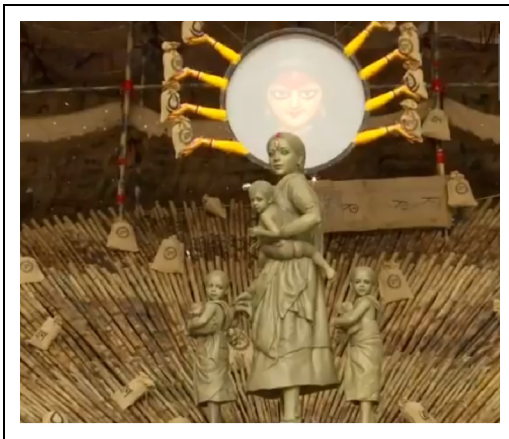
Figure 3. Durga as a migrant worker.

Notes: Source for Panel A image: https://www.dnaindia.com/india/report-durga-puja-2020-petition-filed-in-calcutta-hc-to-stop-celebrations-in-bengal-due-to-covid-19-2849849 . Source for Panel B image: https://www.indiatoday.in/india/story/durga-puja-pandal-bengal-north-dinajpur-tribute-corona-warriors-1734284-2020-10-23 .