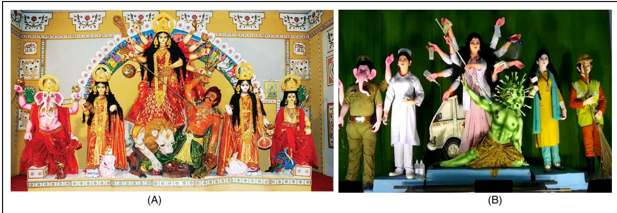
Figure 2. Comparison between Durga idols. (A) Traditional Durga idol and (B) Durga idol during COVID-19.

Notes: Source for Panel A image: https://www.dnaindia.com/india/report-durga-puja-2020-petition-filed-in-calcutta-hc-to-stop-celebrations-in-bengal-due-to-covid-19-2849849 . Source for Panel B image: https://www.indiatoday.in/india/story/durga-puja-pandal-bengal-north-dinajpur-tribute-corona-warriors-1734284-2020-10-23 .