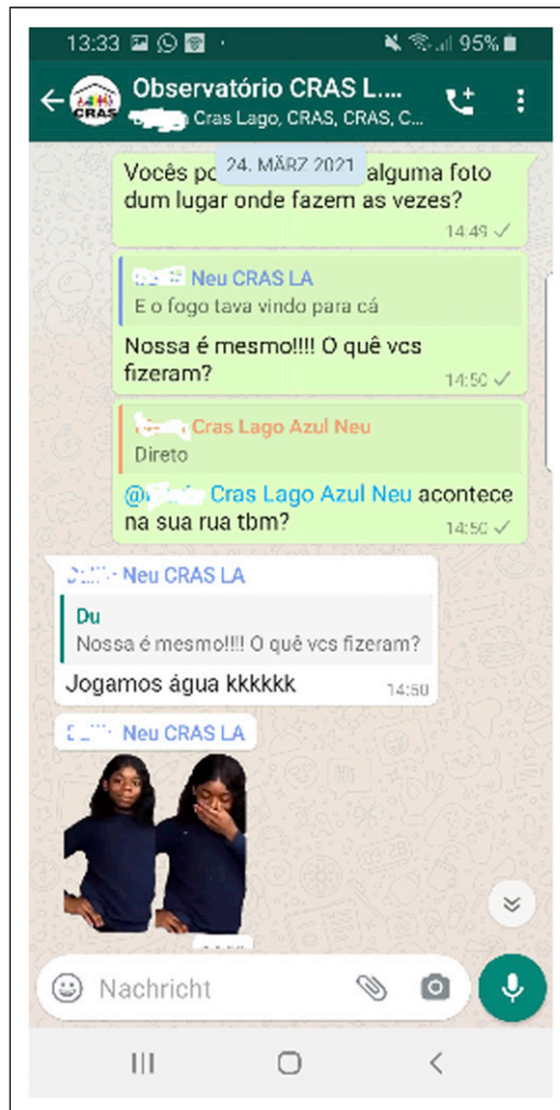
Figure 3. Using humour to address sensitive issues, such as the risk of wildfires.

PI: Would you guys like to do a little video call today?