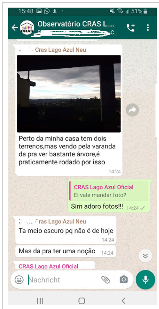
Figure 2. Example of group reflection during synchronous interaction. Part of the translated discussion is shown in the WhatsApp screenshot together with the picture that was commented on in the discussion.

CRAS social assistant: What a great view. There are many trees!