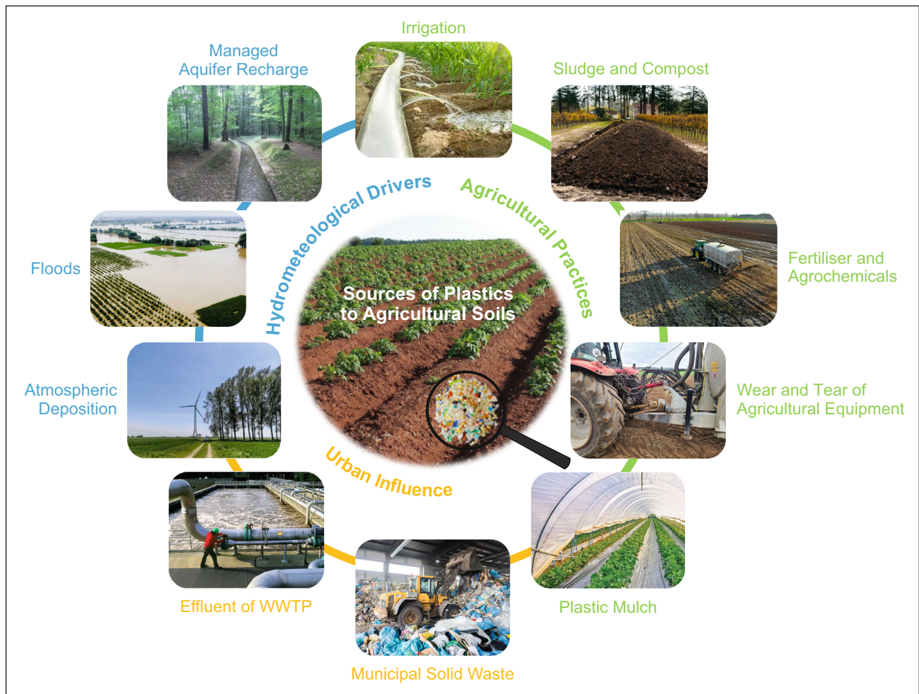
Fig. 1 Plastic pathways to agricultural soils grouped into plastics from agricultural practices, urban influence, and hydrometeorological drivers Abb. 1 Plastikeinträge in landwirtschaftliche Böden, unterteilt in Plastik aus landwirtschaftlichen Praktiken, städtische Einflüsse und hydrometeorologische Faktoren

Plastic enters agricultural soils in all size ranges with pathways varying based on agricultural practices, urban influence, and hydrometeorological drivers (Fig. 1). Microplastic addition can be intentional and unintentional. Unintentional microplastic addition is rooted in the fragmentation of larger plastics, for example when using plastic mulching film or plastic packaging. Other unintentional