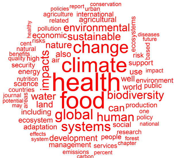
Figure 1 Word cloud of the most frequent words used when discussing health in major global reports on climate change and biodiversity. The 75 most frequent words that appear within a 25-word window around the term ‘health’ across the different reports.

some important insights on current engagement with the health dimensions of climate change and biodiversity. We summarise these key themes, and their policy implications.