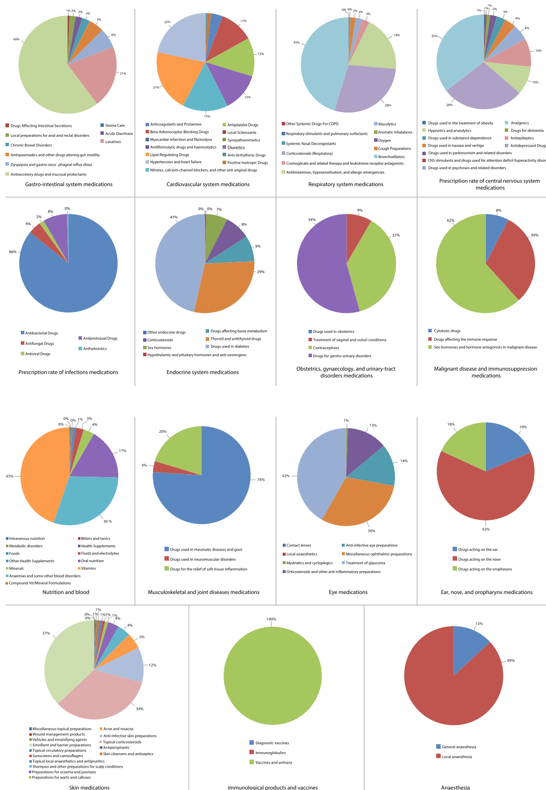
Fig. 2 Percentage of each medication prescription from the total number of medications in the same therapeutic class between 2004 and 2019