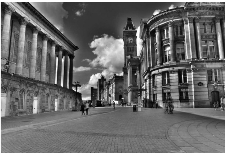
Figure 1. City centre civic grandeur: town hall (left) and council house (right) (photograph by Graham Beards, Wikimedia commons).

As with other rapidly-urbanising cities of the nineteenth century, Birmingham displayed powerful expressions of late-Victorian civic grandeur. These ideas blended with notions of political/religious duty, municipal socialism, public health reform and the city's role in articulating civilising narratives associated with late-nineteenth century British imperialism (Green 2011). Showcase projects, brimming with examples of grandeur, were entwined with much-needed improvements in street design, transportation and sanitation. After achieving 'city' status in 1888, nonconformist (i.e. specifically not Church of England) city officials demonstrated these values in the city's 'civic gospel': 'municipal corporations became [...] moral agencies committed to promoting "civilisation" within their borders' (Beckett 2005, 47). Many prominent and architecturally-significant public buildings were constructed, all of which implied a substantial degree of confidence in driving forward Victorian ambitions of health and virtue, thus helping to sediment Birmingham's important political and economic role in the British imperialism (Chan 2006). These included The Town Hall (1832–1838), the Council House (1874–1879), later extended as a Museum and Art Gallery; the College of Art (1884–1885) and Library (1879–1882) (Figure 1).