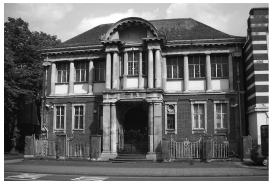
Figure 2. Moseley road baths and library (left): an architectural ensemble of Edwardian grandeur. Balsall Heath college of art (right): part of the public building ensemble.