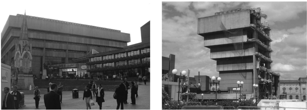
Figure 3. Public space and the 'brutalist' library (left). Last remains: an urban landscape of destruction (right).

stone aggregate instead of the more expensive marble; this led to later criticism that the library was a 'concrete monstrosity' (Clawley 2015). An ambitious bus station underneath the main structure and linked to the inner ring road was never used. The water features and other yet-unbuilt parts of the civic centre fell victim to the 1970s oil crisis. The pedestrian entry-level space was a commercial opportunity, and in 1989–91 the open square was glazed to form an atrium, with single-storey stores and cafes.