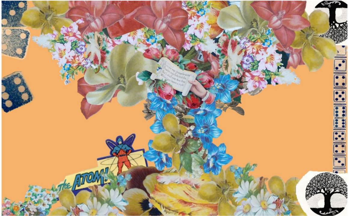
Fig. 2 The Spectacular Possibility of Living a Half Life , by ‘Helix’. © ‘Helix’ and Rona Cran

affective and informally creative nature of their responses to the collage composer and to the fragments themselves. Examples of feedback received from participants include (italics are mine):