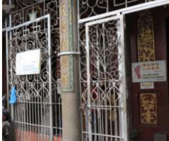
Fig. 6. Restriction at the Kuan Yin Temple prohibits the use of joss sticks inside the temple.

The 'Street of Harmony's' authenticity is tied to tangible and intangible heritage. Considering OUV has established a baseline for the site's values, connecting them to authenticity and integrity is critical. The authenticity of 'Street of Harmony' is defined by how local communities and authorised groups display it and how the relationships between 'objects, people, and places across time' are managed (Jones, 2009: 11). Religious pluralism is evident in the places of worship and the associated events and programmes; however, the site has suffered displacement and population loss since 2000 with the repeal of the Rent Control Act. A representative from GTWHI expressed concern regarding the impact of tourism activities on OUVs, particularly those with multicultural aspects. This sentiment is also shared by a heritage advocate who believes sustainability is the key to preserving the site's values, and local communities should be the primary focus of a place.