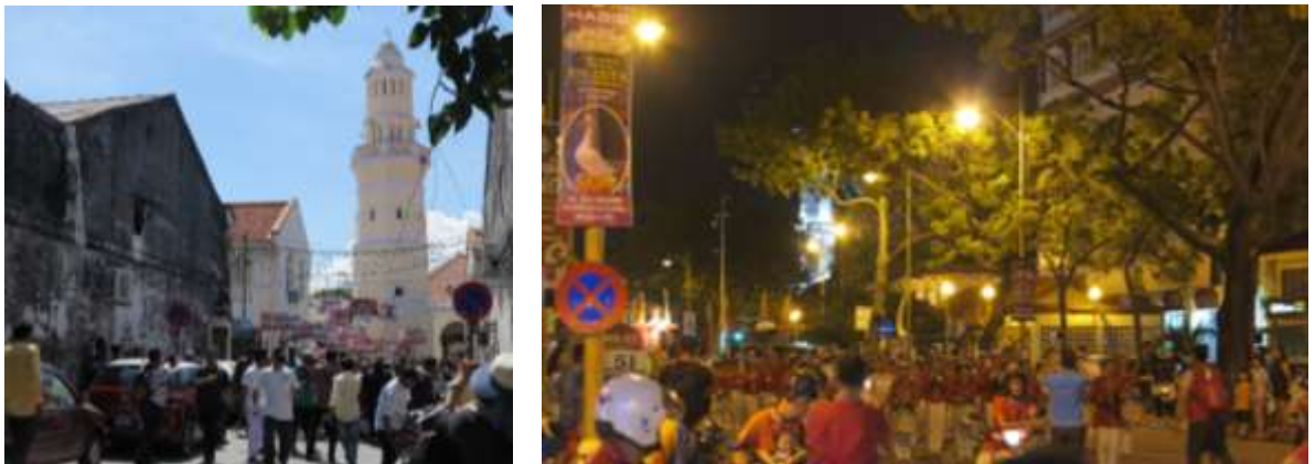
Fig. 3. (a) Observations on the protest against discrimination of Rohingya people in Myanmar; (b) Chingay parade along the street.