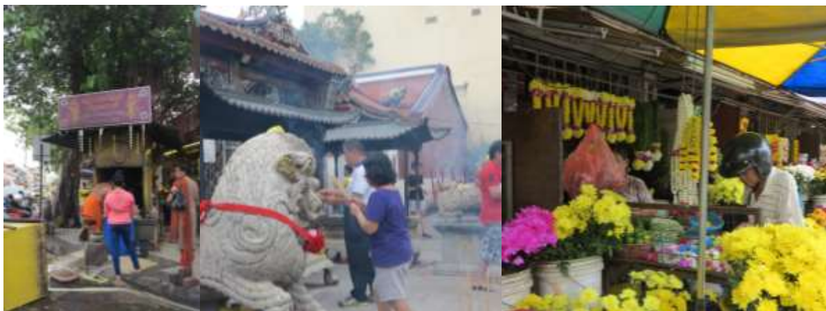
Fig. 4. (a,b & c) Sensory experience at the 'Street of Harmony'.

At the 'Street of Harmony,' certain sensory experiences are more likely to result in place attachment than others — several respondents spoke about what they see, hear, and smell. Many participants pointed out specific, visual elements, such as places of worship, religious and cultural activities, and even street performers and beggars. The smell of 'nasi kandar,' or steaming rice with side dishes, burning joss sticks at Kuan Yin Temple, and the smell of flowers from flower garland vendors were among the smells described by many. Numerous respondents also recognised the sound of the 'azan' (call for prayer) from the mosques and the sound of the Sri Mahamariamman Temple's metal bells.