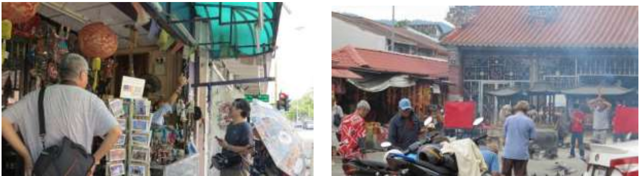
Fig. 2. (a) Selection of participants which focused on local communities; (b) Most interviews were conducted within site, e.g. at the compound of the places of worship.

Observations of daily life in the street were conducted to understand how unique and recurrent events and practices shaped a sense of place. For example, the main author happened to be in the area at the perfect time to observe a protest, and the Chingay parade, on the other hand, was an annual scheduled event advertised to the public through banners placed on the street (refer Fig. 3.). Notes, videos and digital photos were taken during observations and analysed.