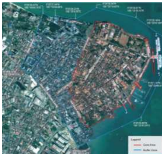
Fig. 1. George Town World Heritage Site.

George Town was a former British free trading port that attracted traders and migrants, e.g. from Europe, China, India and northern Sumatra, and was once home to minority ethnic groups, e.g. Jews, Arabs and Armenians. George Town World Heritage Site (henceforth referred to as the George Town WHS) was included in the UNESCO World Heritage List in 2008. The site (refer Fig. 1) met three criteria of the Outstanding Universal Value or OUV: Criterion II III and IV, which centred on the 'multicultural trading town, multicultural heritage and tradition of Asia and European colonial influences, and a mixture of influences which have created a unique architecture, culture and townscape without parallel anywhere in East and South Asia' (UNESCO, 2008b).