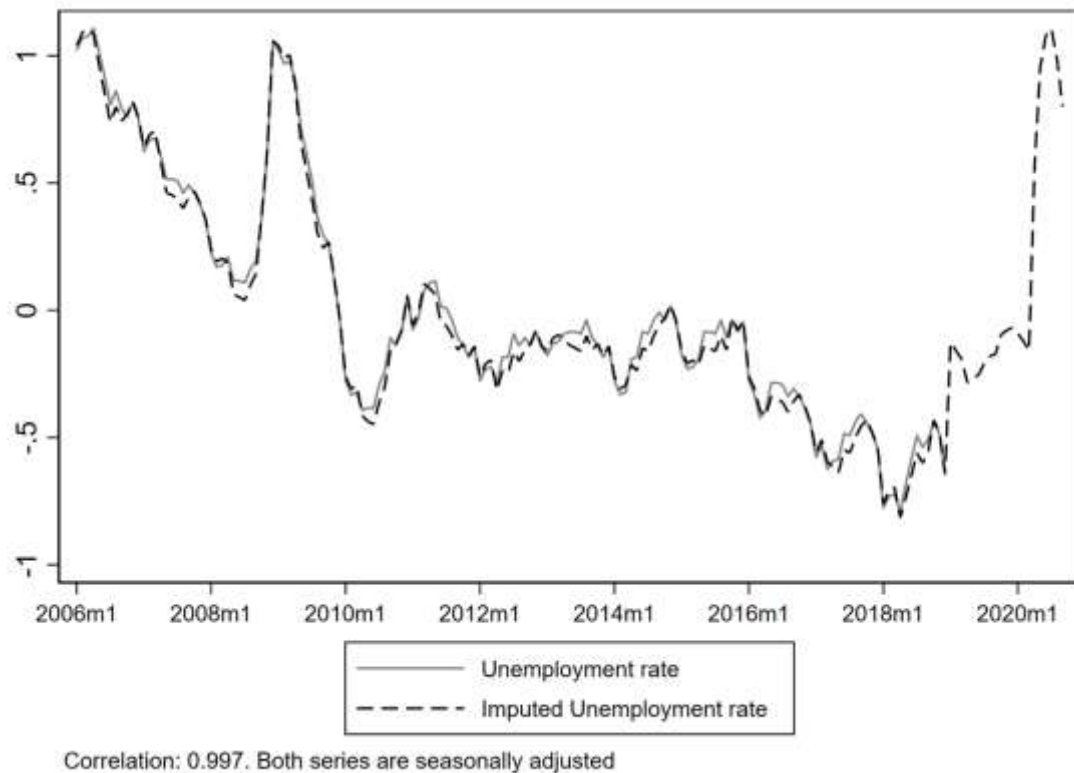
Figure 2. Unemployment statistics

Notes: This figure shows the time series of the official unemployment rate (the solid grey line) and the imputed unemployment rate (the dashed black line) over the 2006 – 2020 period. All series are seasonally adjusted.