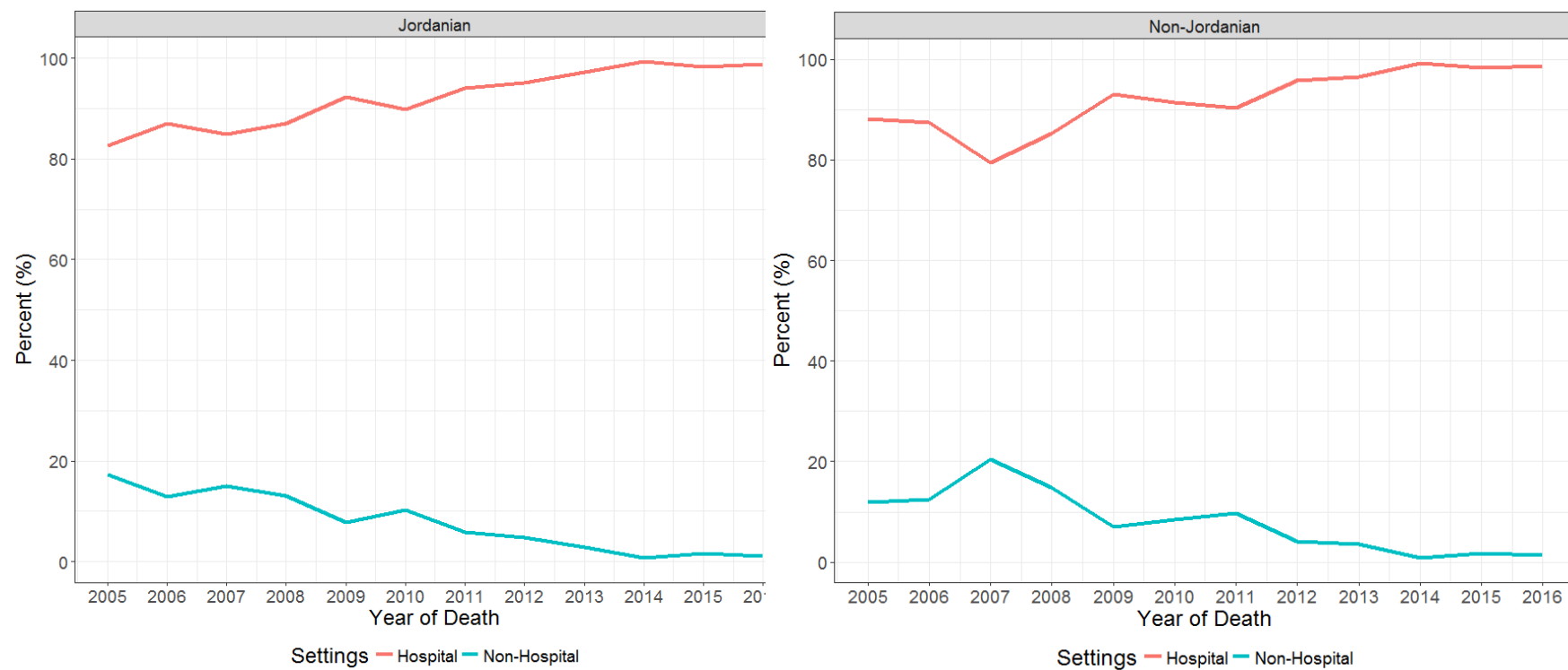
Figure 2. Trend of Jordanian and non-Jordanian deaths by place of death, 2005-2016.