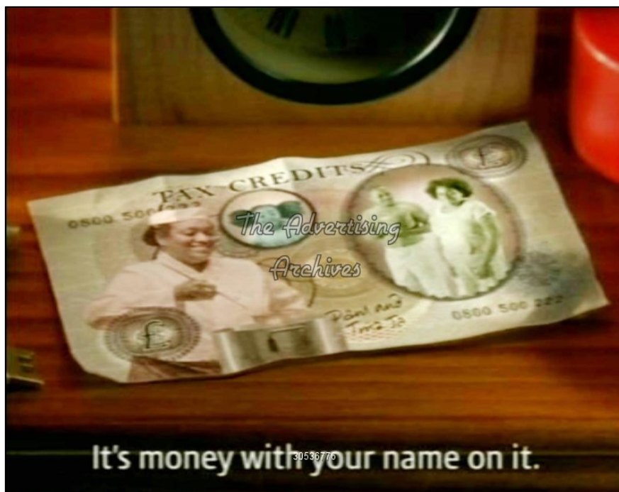
Exhibit 2: HM Inland Revenue Tax Credits television advert, 2004

Exhibit 1 is a still of a television advert for TC. The background resembles a UK banknote. The foreground consist of two panels depicting a happy couple and a smiling baby in domestic settings with the caption “Tax Credits” and “Aaahhh”, suggesting that TC contribute to the well-being and happiness of families.