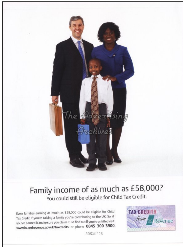
Exhibit 4: HM Inland Revenue Tax Credits magazine advert, 2004