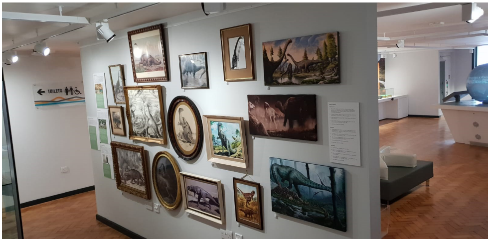
Fig 4. Photo of ‘Drawing out the Dinosaurs’ Exhibition

a little incongruous. Rock is called a dinosaur at points in the text, but it is also clear that he remains an animated statue, not a flesh-and-blood creature, and the fact that he barely resembles the Ancestors he so admires is, in many ways, the point of the book. The answer to this incongruity, of course, is that it is both/and not either/or. It is precisely because of the mutability of the dinosaur as a social object—its ability to inhabit two apparently contradictory states simultaneously—that Rock can be both an innocent student of the Mesozoic past and an instructive product of it. This mutability is also exercised by the statues themselves in real life; it is granted, in part, by the textual constitution of the museum object. Revising labels (doing away with old ones when new information is discovered) is essential for the pedagogical aims of the museum, but can also be seen as yet another strategy to obscure the instability of truth in the museum, and to hide the speculative nature of much of the knowledge displayed. While we suggested that restorations are ‘dangerous’ because they reveal the speculation which was always inherent in the museum display, they are also valuable because they cannot be so easily rewritten or swept under the rug. Indeed, there are often laws in place specifically to prevent this (the Crystal Palace models are categorized as Grade I listed buildings in order to ensure their protection).