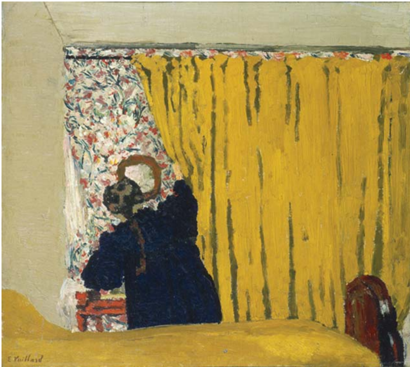
Fig. 3. Édouard Vuillard, The Yellow Curtain , c. 1893, oil on canvas, 34.7 × 38.7 cm. Ailsa Mellon Bruce Collection, National Gallery of Art, Washington D.C.

image. 11 Here the visual also operates as a metaphor for the haptic, with pattern playing a critical role in the signifiatory process. 12 The imaginative sense of what it feels like to be surrounded by, to brush against and to leave corporeal traces in, the fabrics and upholstered surfaces of cramped and modestly bourgeois domesticity, even the hyper-imaginative sense of what it might feel like to occupy a domestic linen cupboard, achieves an acute level of figural representation in the physiognomic dissolution and spatial containment of The Linen Closet's barely discernible maternal figure. 13