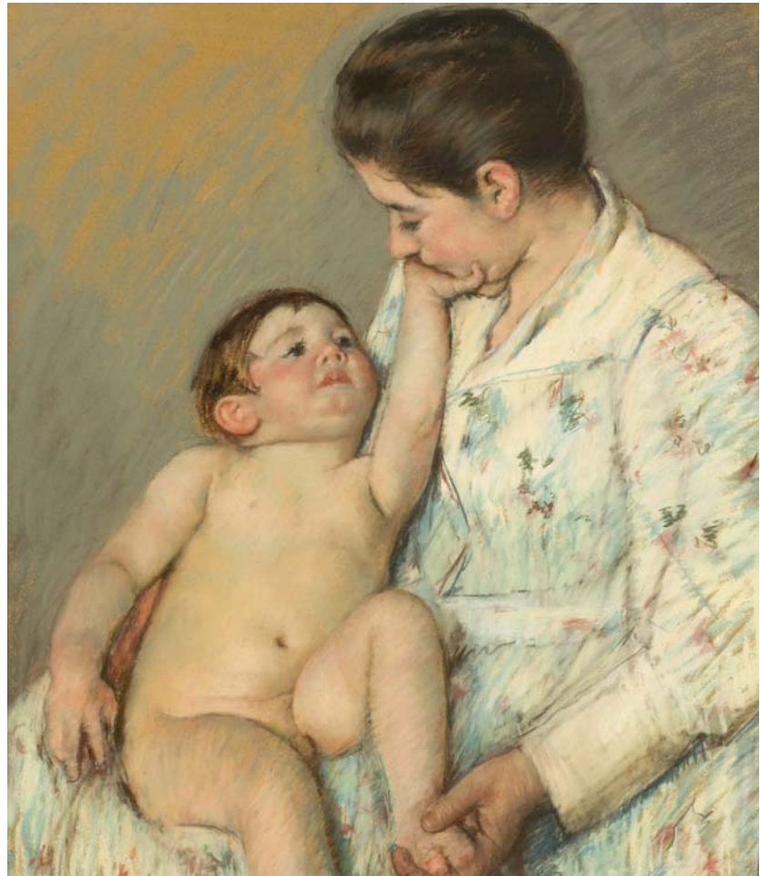
Fig. 2. Mary Cassatt, Baby's First Caress , 1891, pastel on paper, 30 in. × 43 in. New Britain Museum of American Art. Harriet Russell Stanley Fund, 1948.14.