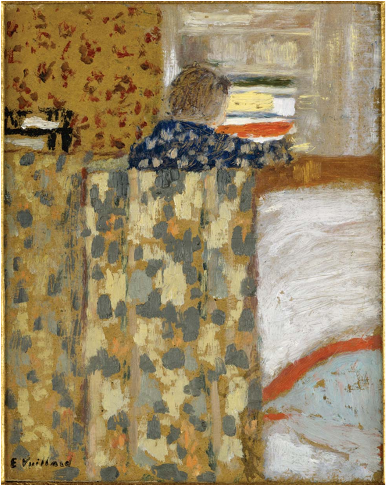
Fig. 1. Édouard Vuillard, The Linen Closet , c. 1893, oil on cardboard, 25 × 20 cm. Musée d'Orsay, Paris.