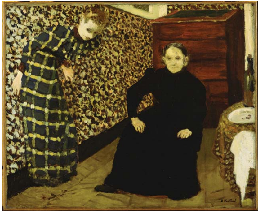
Fig. 8. Édouard Vuillard, Interior: the Artist's Mother and Sister , 1893, oil on canvas, 46.3 × 56.5 cm. The Museum of Modern Art (MoMA), New York. Gift of Mrs Saidie A. May. 141.1934.

house distributes both to children and to servants, the following week's linen. . . On the basis of this truth we believe a principle can be established: where there is order in the linen of a house there is order in all the house'. ('C'est le samedi soir ou le dimanche matin que la maîtresse de maison distribue tant aux enfants qu'aux domestiques, le linge nécessaire pour la semaine suivante. . . Nous croyons que l'on peut ériger en aphorisme cette vérité: Lorsqu'il y a de l'ordre dans le linge d'une maison il y a de l'ordre dans toute la maison.' Augusta Moll-Weiss, Le Livre du foyer (Librairie Armand Colin: Paris, 1912), p. 167.)