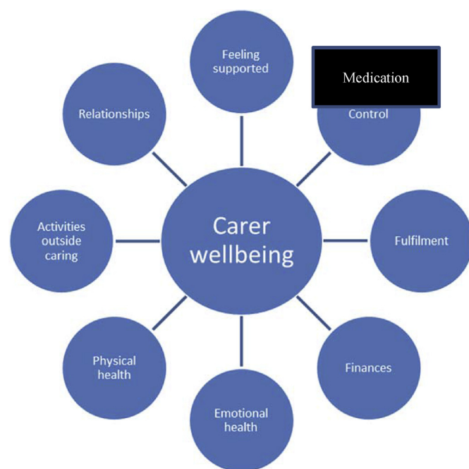
Fig. 1. Focus group exercise to identify links between patient services and carer wellbeing. Circles indicate pre-defined outcomes (Brouwer et al., 2006; Deeken et al., 2003; Al-Janabi et al., 2008) and the rectangle is example of patient intervention or aspect of service delivery. Note: Intervention prompts (cards) were: medication, psychological intervention, rehabilitation, complementary/alternative therapy, and social care. Service delivery cards were: inpatient care, transfers between services, involvement of family, funding/organisational changes, and location of care. Participants were also provided with blank cards.

through a focus group and/or interview; and (iii) thematic saturation had been reached as judged through field notes.