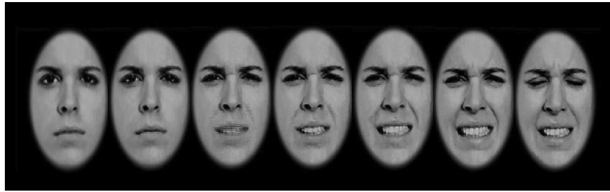
Figure 1. Process of change during the presentation of dynamic faces.

adequate psychometric properties for both clinical and non-clinical Iranian samples 32,33 . Internal consistency (Cronbach's alpha) in the present sample for the total score was 0.88.